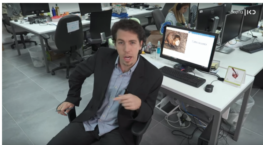
Video 4. KAN – Negative Campaign Against Us.

One of my interviewees revealed that at some point they realized that the negative campaign against KAN was orchestrated through fake Facebook profiles and paid talkbacks, saying: 'We understood that there was an organised, financed attack against us on social media'. In response, the digital division produced a video about fake profiles in which they 'explained that lately there are a lot of negative paid talkbacks and fake Facebook profiles attacking us and we want the public to know how to identify them. A day after the video was posted online these talkbacks stopped'.