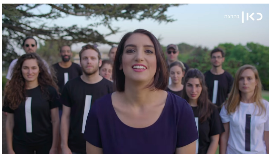
Video 3. KAN – We are Going on Air.

if we don't control it?', 'KAN's employees all belong to "Breaking the Silence" ( Shovrim Shtika , a controversial opposition organisation in Israel), and 'They're all spoiled affluent kids from Tel Aviv'. The race ends with KAN's TV presenter picking up the microphone and saying: 'We are KAN [here in Hebrew], going on air'. This video is a clear act of defiance against the politicians threatening to close the new PSM corporation. It presents criticism of it as hurdles that can be overcome on the way to the establishment of public broadcasts.