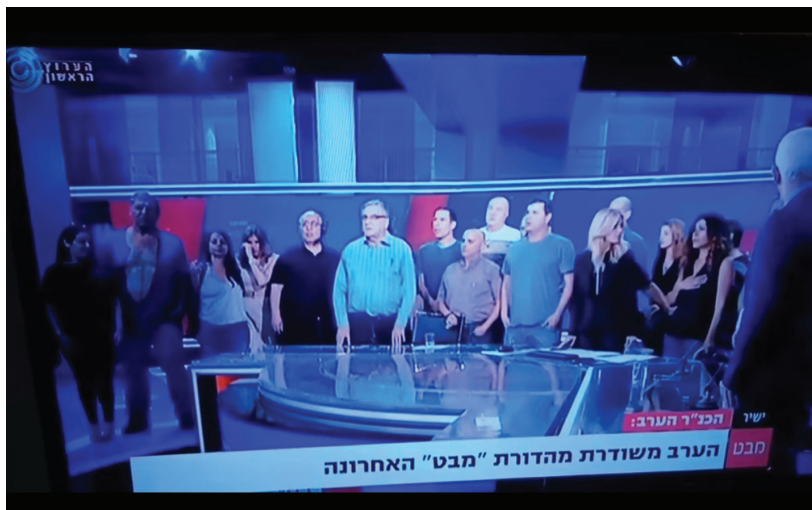
Video 1. Tearful IBA Employees at the Last Newscast.