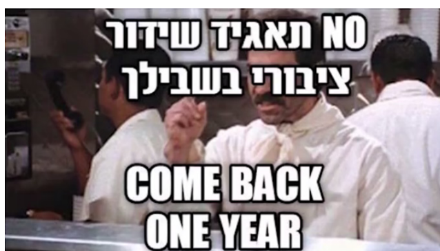
Video 6. KAN – Thank You for Making Us Laugh During Hard Days.

Thus, in its struggle to resist the strong pressure on it, KAN sought the public's support. As one employee explained: 'In some cases, when we faced harsh criticism, we let members of the public defend us. This was also a way for us to examine our relevance and legitimacy in the eyes of the public'. KAN's social media operators acknowledged the public's support and posted memes created by the users. The video appeared with the following text: 'Thank you for making us laugh during the hard days we are going through. You have given us strength to continue to create, to build, to dream and to go on with our struggle for an independent, diverse and high quality public media service.' Here the public is clearly framed as an ally.