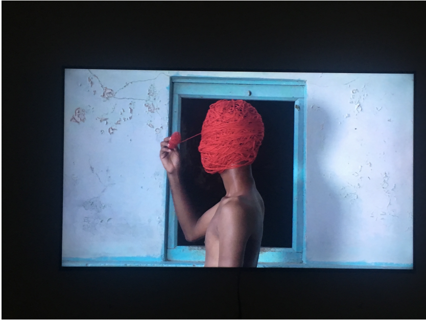
Fig. 5: Photography of a video still from 1941 , short film, by Asim Abdulaziz (2021).

Further, works by Noel W. Anderson were powerful and very much on the point of the oppressive (digital) surveillance state that disproportionately attacks Black Americans. His work, a combination of hand and machine work: weaving of cotton tapestry with distorted digital pictures of historical photographs: one of black men being rounded up, undressed and in cuffs ( Line up ); and another of a search and arrest of another man ( Downward dog ), among others. The digital distortion reveals the surrealism of this violence and the mechanistic elements of it that are continued further with digital surveillance and digital judiciary (things that were later discussed with Anderson in the Digital Divide conference).