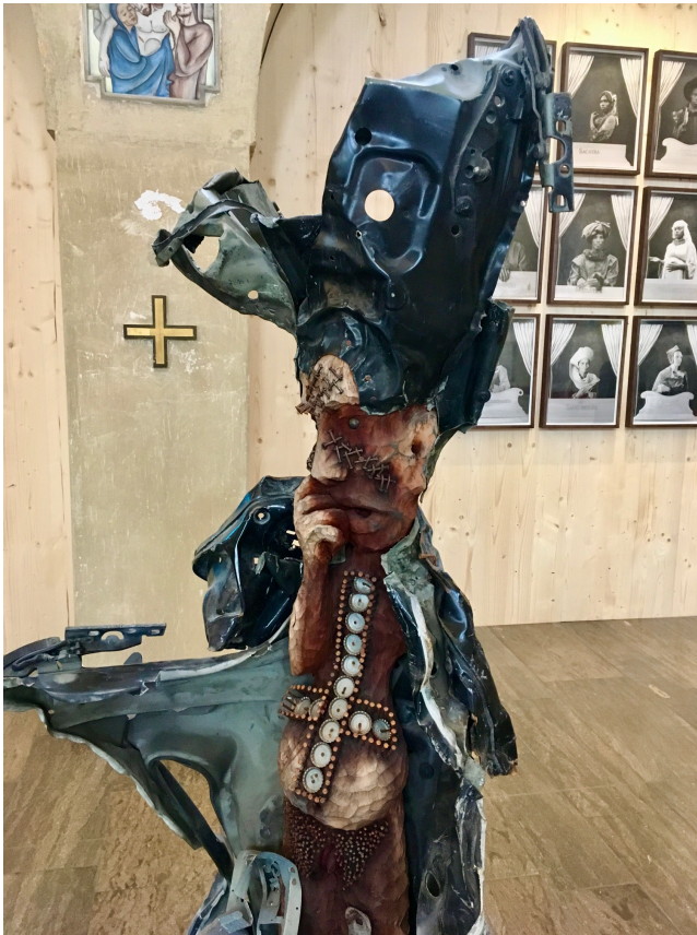
Fig. 2: Photography of Atis Resistans, Ghetto Biennale at St. Kunigundis Church with sculpture by Andre Eugene, and Leah Gordon's The Caste Portraits photographs (2012) in the background.

But the scarcity of materials for many artists is a reality, such as with the Haitian-Atis Resistans (Resistance Artists), who use a lot of recycled materials, found objects, and even human skulls (Fig. 2); this harsh reality can produce very affective works with depth and complexity that a diamond skull might not. As Ben Davis wrote in his review of the exhibition, documenta 15 provides a show that one might otherwise never be able to see.[27] I recognise it as a grand opportunity for the public and a task that the ruangrupa collective had taken on with optimism and resilience, achieving results despite the challenges they faced, mainly thanks to the lumbung practice that provided a genuinely new exciting quality to documenta.