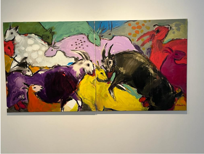
Fig. 1: Image of Mohammed Al Hawarji, Animals , 2012, oil painting.

smuggled paint to work with or as payment. Despite their efforts and hopes for making ‘art for the art’s sake’ their non-political paintings have nonetheless become political.[26] As if to highlight that point, the space where Palestinian art works were exhibited had been vandalised shortly before the exhibition started.