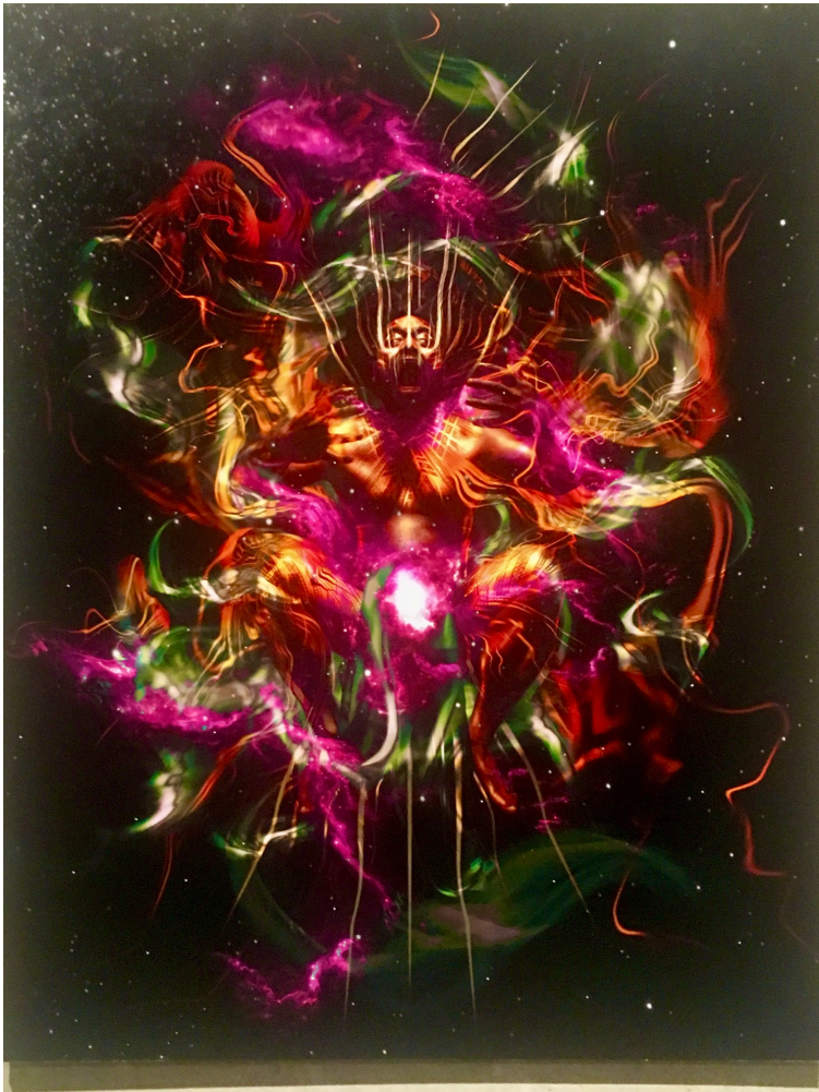
Fig. 3: Photography of Māhia Te Kore, Jaimie Waititi, FAFSWAG, The Eyes of Chaos – Pati the Sun (2019), print.

The controversy started in January with an anonymous blog post decrying anti-Semitism due to the connection of some Palestinian artists to the BDS (Boycott, Divestment, and Sanctions) movement.[28] But the big scandal was first connected to the mural People's Justice by Taring Padi, with anti-Semitic imagery reminiscent of Nazi propaganda from the 1930s, unveiled on the opening night (denounced by FAZ title as 'Ein Schlag ins Gesicht' – 'A hit in the face' of the German audience). Then, the screening of Japanese archival documentary films (Tokyo