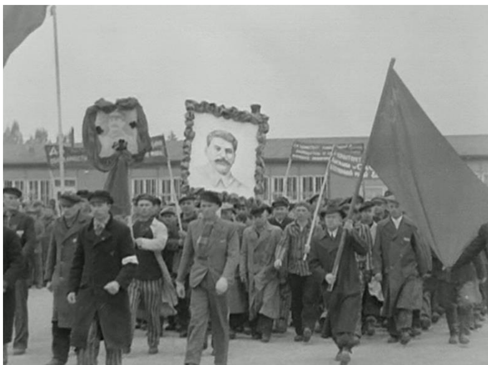
Figure 9. Still from MYSTÈRES D'ARCHIVES. UNE COLLECTION DE FILMS DOCUMENTAIRES , F2013

Footage of these celebrations exists; 11 however, it was seldom included in the Allied documentaries, for they were supposed to tell another story. DIE TODESMÜHLEN , which the US Military Government for Germany