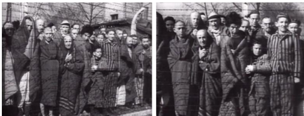
Figure 3. Stills from AUSCHWITZ: FILM DOCUMENTS OF THE MONSTROUSLY EVIL CRIMES OF THE GERMAN GOVERNMENT IN AUSCHWITZ , Elizaveta Svilova, SU 1945