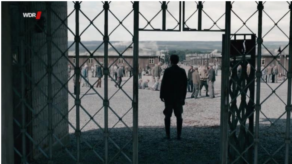
Figure 22. Still from NAKED AMONG WOLVES , Philipp Kadelbach, DE 2015