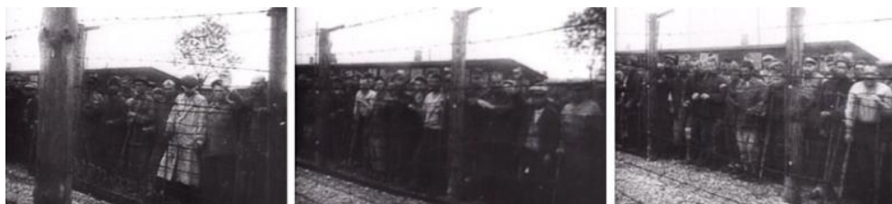
Figure 2. MAJDANEK, Irina Setkina, SU 1944

fascist regime, none of the three contains a single image of triumph or elation. However, they present another emblematic motif of camp liberation, probably the most iconic: survivors standing behind a barbed wire fence filmed from a slowly passing vehicle. This scene was also staged, first in Majdanek and re-staged at Auschwitz with improved results.