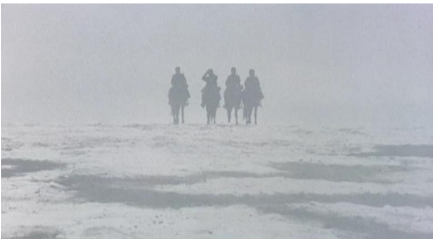
Figure 17. Still from THE TRUCE , Francesco Rosi, IT 1997