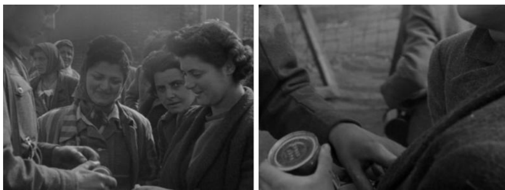
Figure 11. Stills from GERMAN CONCENTRATION CAMP FACTUAL SURVEY , UK 1945/2014

There might be more of this in unedited footage, but it is equally possible that cameramen did not think it important to cover such human interactions. What Allied cameramen apparently did not even try to cover was liberators' own bewilderment, which they regularly expressed in memoirs and interviews. In order to see images of this, we have to turn to feature films, which I will now do. In addition to feature films' ability to turn the camera back on the liberators who in 1944–45 turned their cameras on the liberated camps, they can also tell stories of liberation from the perspective of survivors.