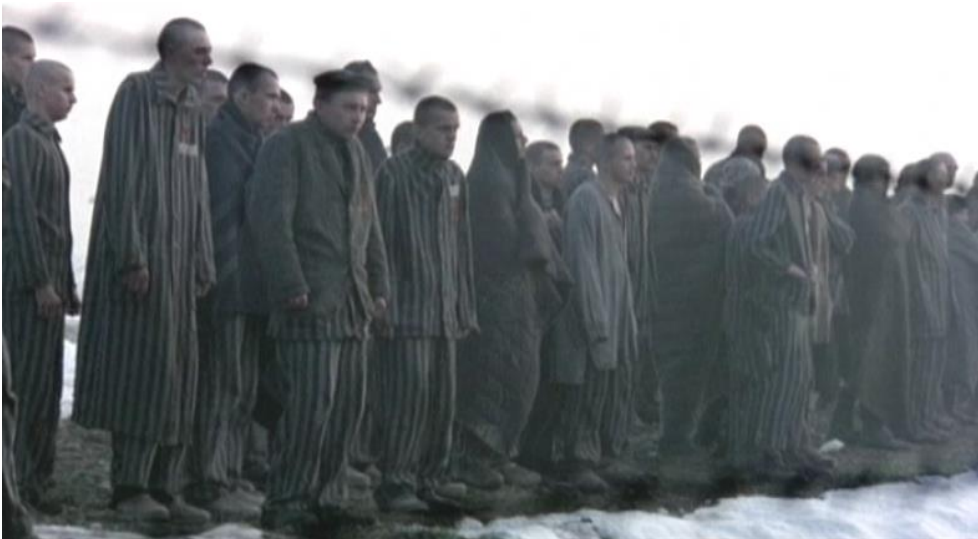
Figure 18. Still from THE TRUCE , Francesco Rosi, IT 1997

Since the beginning of the scene, the only sounds have been the horses' hooves and the inmates' wooden clogs on the hard snow and horses breathing heavily. Next comes a series of shot-reverseshots between, on the one side, Levi, his comrade, and other inmates who are slowly approaching the fence and, on the other side, and through their binoculars, the Soviet soldiers. The horses are filmed from a low camera angle so that they do look enormous, as Levi describes them in his memoir. Contrary to the memoir, however, the soldiers, who have now reached the gate, are expressionless; they show no sign of shock or shame even though they must realize that they have come across an immense crime. Rather, they seem coarse, impassive, at best focused on the task before them. Thus, THE TRUCE neither grants the Soviet soldiers the reactions of "the just man" witnessing someone else's crime, which Levi saw in them, nor does it stage the inmates awaiting their liberators as impressively as Red Army cameramen did at Auschwitz. THE TRUCE does seem to quote historical Soviet footage; however, its shots of prisoners lining up along the barbed wire resemble the blurry Majdanek shots much more than the famous ones at Auschwitz.