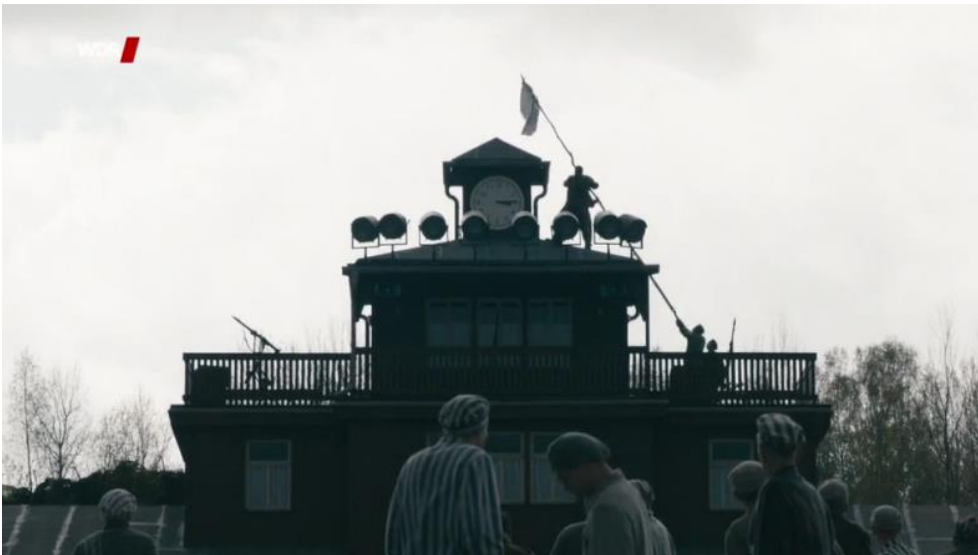
Figure 20. Still from NAKED AMONG WOLVES , Philipp Kadelbach, DE 2015