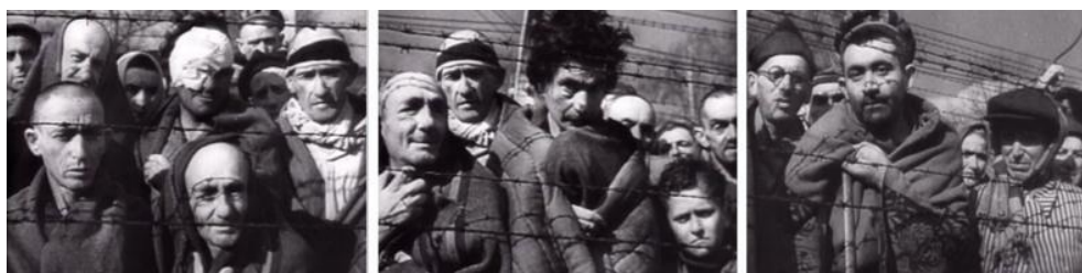
Figure 4. Stills from AUSCHWITZ , Elizaveta Svilova, SU 1945