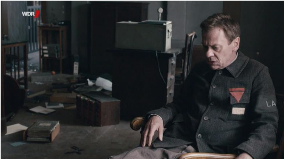
Figure 19. Still from NAKED AMONG WOLVES , Philipp Kadelbach, DE 2015