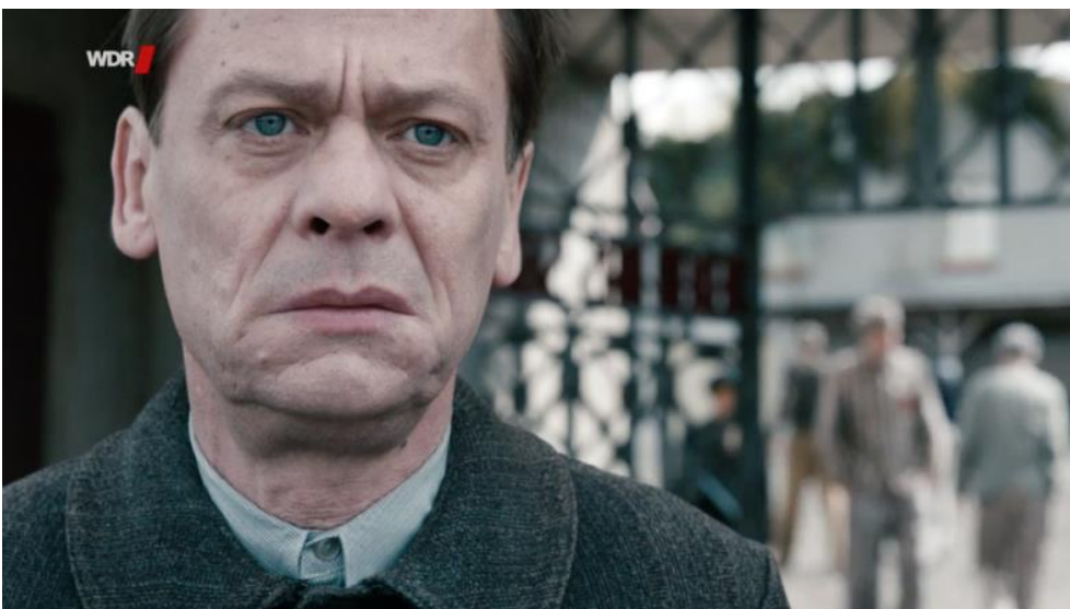
Figure 21. Still from NAKED AMONG WOLVES , Philipp Kadelbach, DE 2015