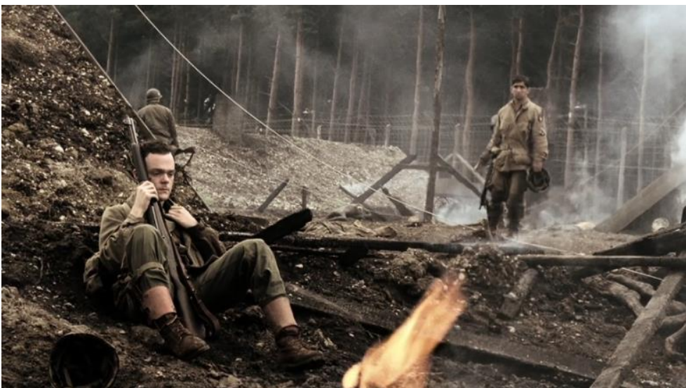
Figure 15. Still from BAND OF BROTHERS , Episode 9: WHY WE FIGHT , David Frankel, US 2001