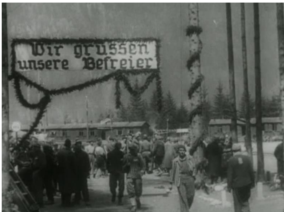
Figure 8. Still from DIE TODESMÜHLEN , US 1945

of political prisoners organized, e.g., in Ebensee, Mauthausen, Dachau, Buchenwald, and Sachsenhausen.