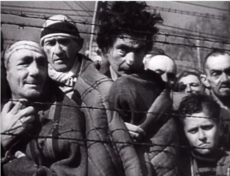
Figure 1. AUSCHWITZ: FILM DOCUMENTS OF THE MONSTROUSLY EVIL CRIMES OF THE GERMAN GOVERNMENT IN AUSCHWITZ, Elizaveta Svilova, SU 1945

Since SS camp personnel obeyed the strict prohibition against photography in Nazi annihilation, concentration, and work camps, the footage that Allied cameramen shot in such camps during and shortly after their liberation filled this void in visual documentation. Thus, what we imagine went on in Nazi camps while in operation has been shaped by pictures that document their very last stages, after the SS had fled most of these crime scenes, most inmates had been killed or died, and tens of thousands of the still living had been evacuated on death marches. So, though the arrival of Allied soldiers was a turning point for survivors, the film that Allied cameramen shot in those days tells us more about the effects of Nazi terror than about survivors' liberation from it. This