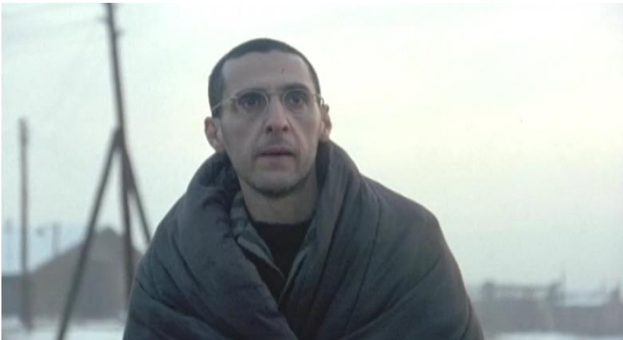
Figure 16. Still from THE TRUCE , Francesco Rosi, IT 1997

Except for this line, which the film almost quotes, the liberation scene in THE TRUCE bears little resemblance to Levi’s description. Rather, it presents its own filmic narrative of an ambivalent moment. After a short, chaotic, and noisy introductory scene in which SS men set fire to huts, shoot some prisoners, order others to burn documents, and blow up a crematorium, the next scene starts very quietly, calmly, and slowly. On the horizon, which is barely visible between “the grey of the snow and the grey of the sky,” four horsemen appear; they come closer and stop. We see in close-up the fur cap of one with a small gold hammer and sickle in a Soviet red star. It is too foggy to read the look in his eyes. One of the four takes out binoculars and inspects what lies in front of them. Cut. From inside the camp, we now see two inmates carrying a dead man in a blanket—others in the background are doing the same—and with a last of their strength roll the corpse into a ditch filled with other corpses and collapse. It is when one of the two stands up, catches his breath, looks around, and sees the four horsemen in the distance that we understand that he is the protagonist, Primo Levi.