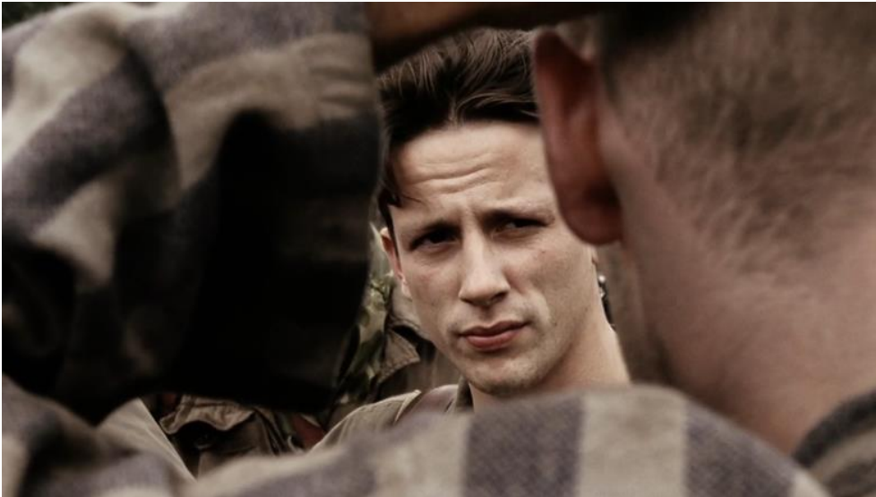
Figure 13. Still from BAND OF BROTHERS , Episode 9: WHY WE FIGHT , David Frankel, US 2001