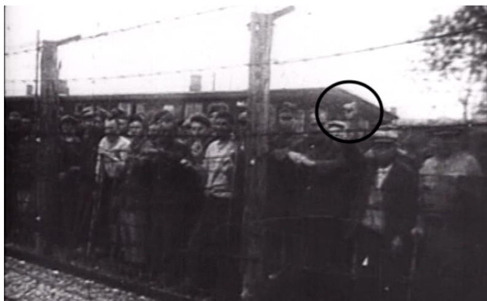
Figure 5. Still from AUSCHWITZ , Elizaveta Svilova, SU 1945

10. MAJDANEK: FILM DOCUMENTS OF THE MONSTROUSLY EVIL DEEDS OF THE GERMANS IN THE EXTERMINATION CAMP OF MAJDANEK, IN THE TOWN OF LUBLIN (MAJDANEK: KINODOKUMENTY O CHUDOVISHCHNYH ZLODEIANIJAH NEMTSEV V LAGERE UNICHTOZHENIJA NA MAJDANEKE V GORODE LUBLIN/ Irina Setkina, SU 1944); AUSCHWITZ (Elizaveta Svilova, SU 1945); and FILM DOCUMENTS OF ATROCITIES COMMITTED BY THE GERMAN-FASCIST INVADERS (KINODOKUMENTY O ZVERSTVAKH NEMTSKO-FASHISTSKIKH ZAKHVATCHIKOV / Elizaveta Svilova, SU 1946).