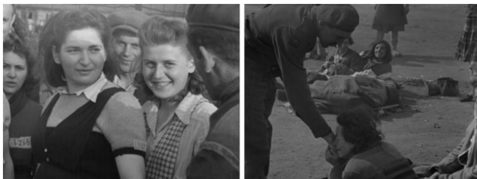
Figure 10. Stills from GERMAN CONCENTRATION CAMP FACTUAL SURVEY , UK 1945/2014

All of the Allied documentaries portray this help more or less explicitly, yet it is surprisingly seldom that we see survivors and liberators genuinely interacting, e.g., in conversation or through bodily contact, of which there must have been more than we are shown. 14