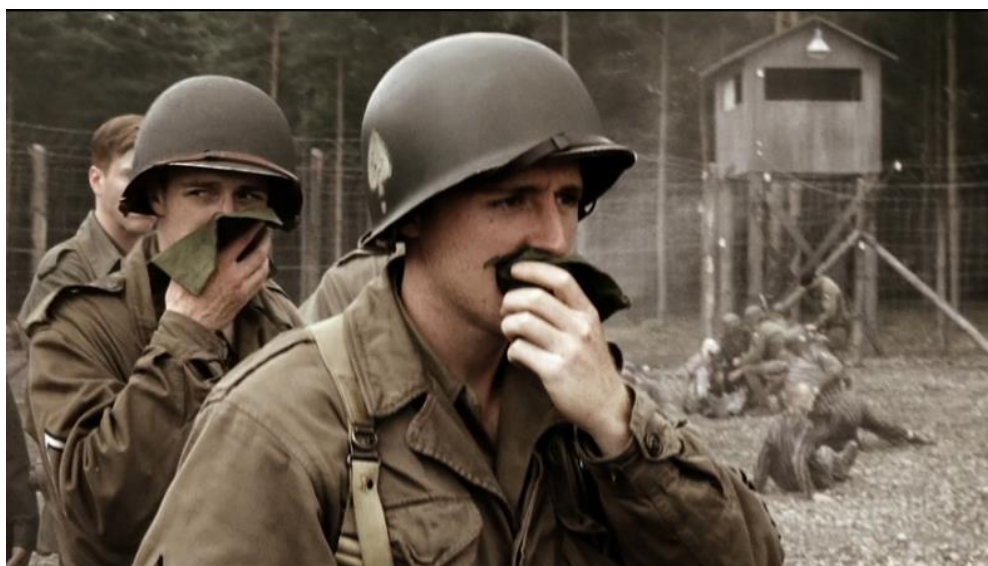
Figure 12. Still from BAND OF BROTHERS , Episode 9: WHY WE FIGHT , David Frankel, US 2001

faces of the liberators, even more intensely than on the liberated. Some stare in apparent disbelief; some cover their eyes or noses with handkerchiefs; some get sick; others cry. These are no reverse shots from the perspective of survivors, some of whom are trying to interact with their liberators, apparently asking for food, tearing at their sleeves, or hugging and kissing them. Rather, when the camera does not show us the scene from the soldiers' perspective it circles them dizzyingly to suggest how they feel. Though the liberated figure prominently in the episode, it remains the story of the "band of brothers" who are transformed by this terrifying experience.