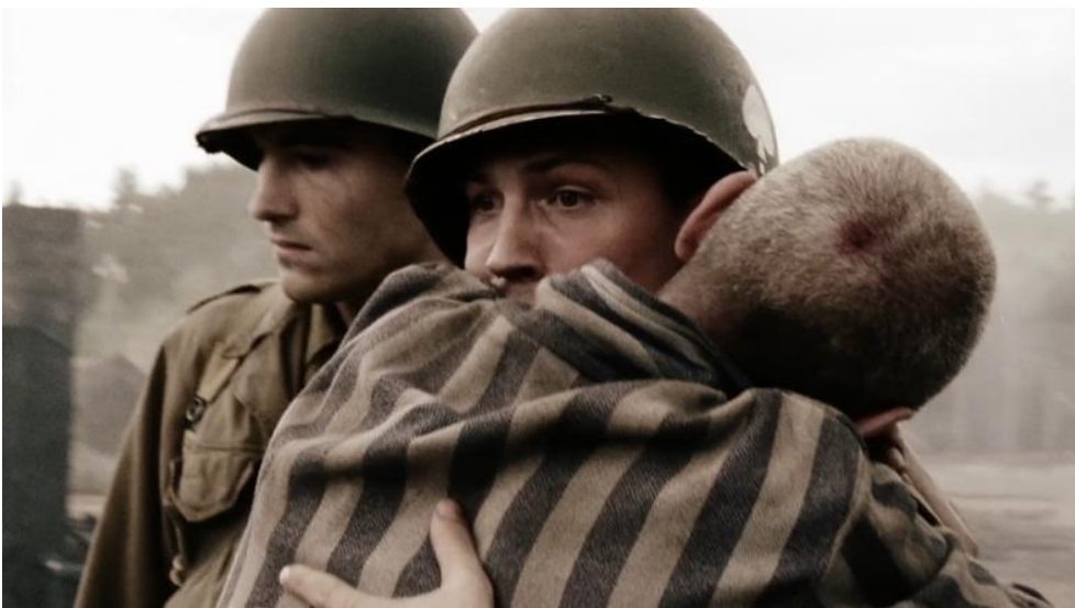
Figure 14. Still from BAND OF BROTHERS , Episode 9: WHY WE FIGHT , David Frankel, US 2001