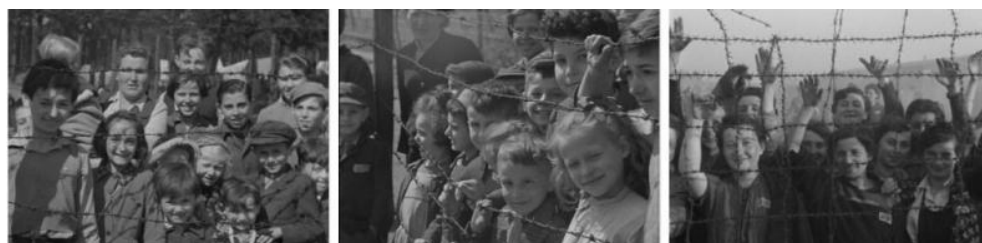
Figure 7. Stills from GERMAN CONCENTRATION CAMP FACTUAL SURVEY , UK 1945/2014

Some of these sequences look as if the initiative to stage them could have come from the survivors themselves, who wanted to symbolize victory, international solidarity, or express respect for the dead by collectively waving into the camera, giving the victory sign, or taking off their caps. This is definitely true of the liberation ceremonies and May Day celebrations that international committees