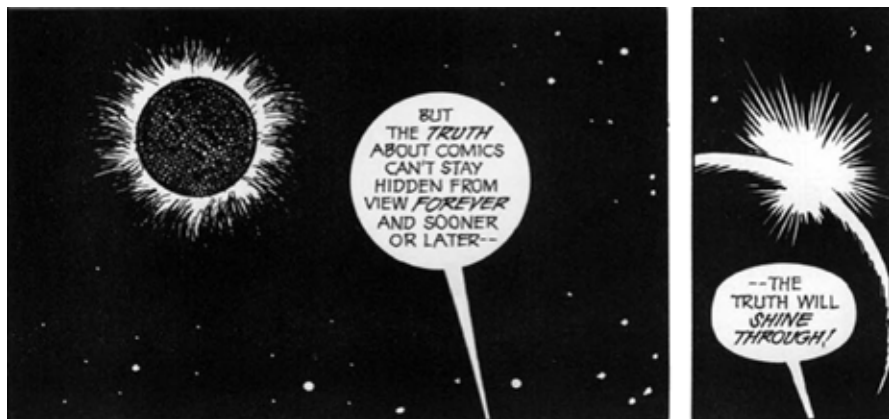
Fig. 1: The truth about comics still needs to be uncovered. Scott McCloud, Understanding Comics: The Invisible Art , New York: Harper Perennial, 1994 (1993), 211.

"The truth about comics can't stay hidden from view forever ", argues Scott McCloud in his comic book about comic books. 1 In a way, this short quotation expresses the rich, ambivalent, and fascinating history of the medium that is the comic book. The comic book has been polarising opinions for more than 120 years: some have considered it a threat to the intellectual development of the younger generation, as venomous for the reigning moral standards in society, as cheap – and morally dubious – entertainment, as escapism, or as the reason for the demise of language. Others have praised the comic book for its creativity, for its ability to put children in touch with the pleasure of reading, or for its contemporary and innovative expression. The comic book has also been a popular medium for political, ethical and economic manipulation. 2