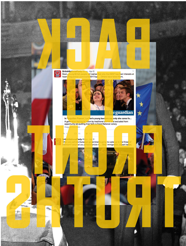
Montaged poster poem (English version) from Nick Thurston, Hate Library (2017).