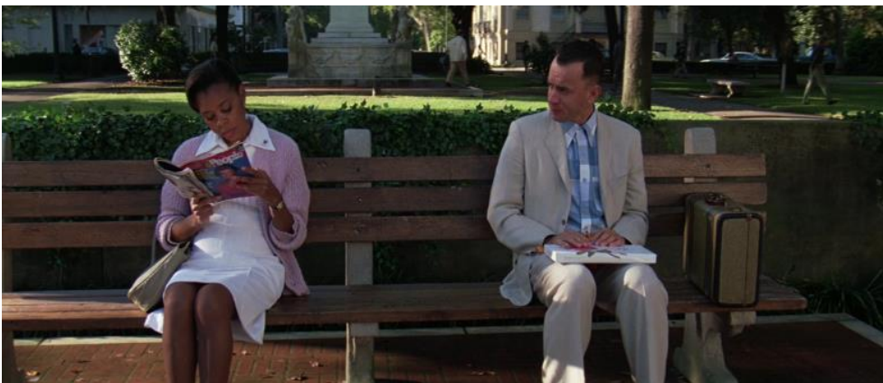
FORREST GUMP, Robert Zemeckis, USA 1994

We do not experience any movie only through our eyes. We see and comprehend and feel films with our entire bodily being, informed by the full history and carnal knowledge of our acculturated sensorium. (Vivian Sobchack) 1