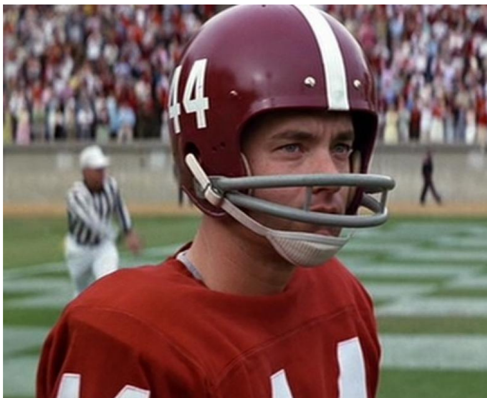
Forrest Gump at the Football Stadium

The example of a six-year old first grader attending an American school can show how spectators try to create a mental situation model for the film sequence. The boy’s first comment on the sequence was “Forrest Gump makes a touch down.” Children remember scenes from fictional films that are linked to sport: this was already shown in research on the effects of the media in the 1930s. 22 But when it came to a more concrete description of the scene that showed the abolition of racial segregation at the University of Alabama, the boy encountered difficulties. He tried to localize the events in time by asking, “Was Martin Luther King already born?”