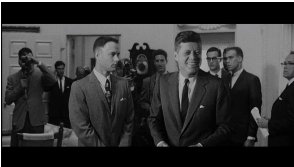
Forrest Gump meets President John F. Kennedy

The film FORREST GUMP , which I will focus on here, is not just a twenty-year-old Hollywood blockbuster, but a phenomenon that remains controversial today. 11 The main figure of the film, embodied by Tom Hanks, is a contemporary witness. Forrest Gump lives through decisive events of American history, influences them, and reports about his experiences to fellow passengers waiting at a bus stop. Due to his low IQ, he remains unaware of the historical significance of his experiences during his life. That’s the running gag of the film: the spectators can identify the historical subject matter and the historic figures, on which Forrest Gump reports in a highly unreliable way. 12