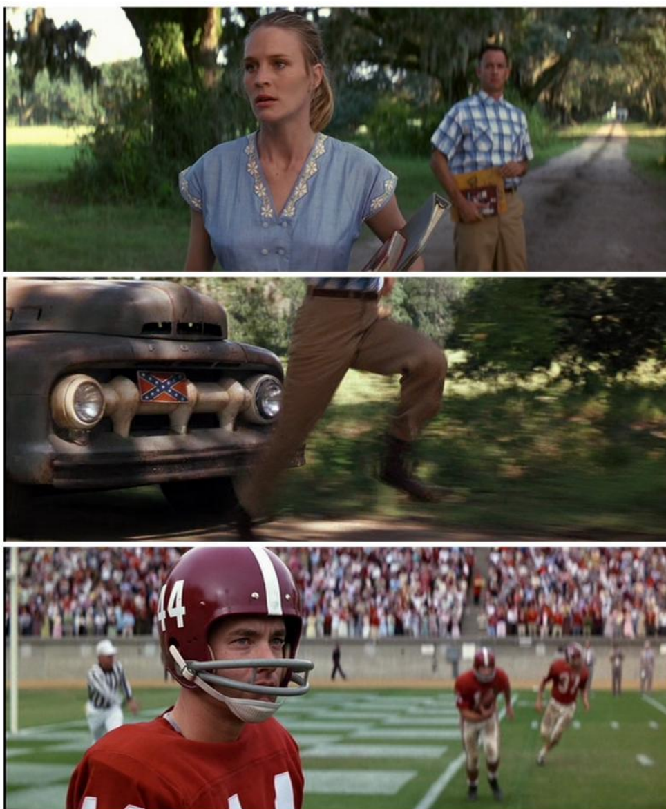
Figure 1. FORREST GUMP , Robert Zemeckis, USA 1994 FORREST GUMP , DVD Paramount Home Entertainment

To pursue the levels on which spectators perceive history in film, I experimented with a variety of methods. One technique included playing two sequences from FORREST GUMP for my subjects (of various nationalities) in the U.S. and then to ask them to report what they saw. 18 I selected those scenes that could reflect as many different aspects of plot and story as possible in condensed form in five to ten minutes. 19