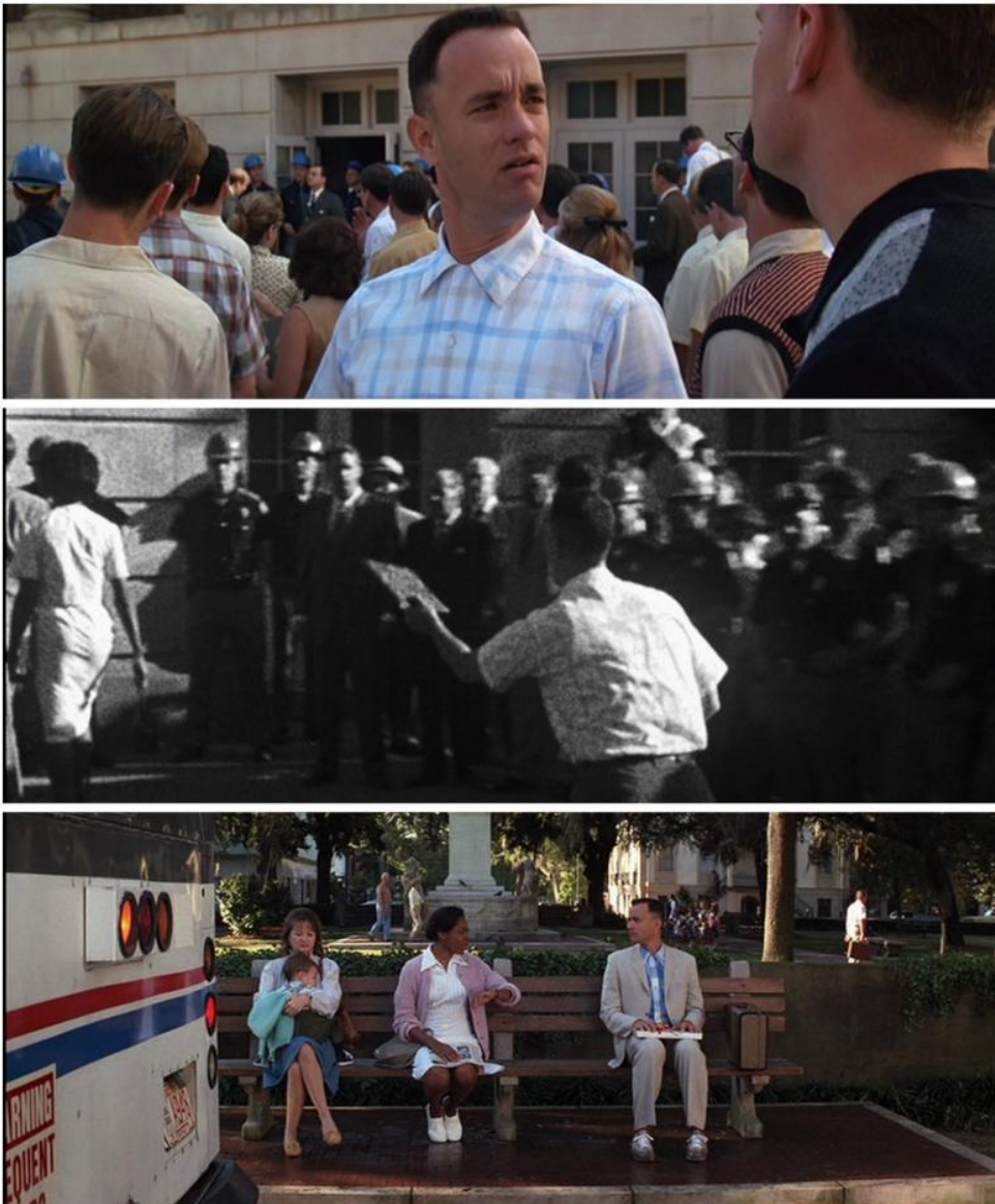
Figure 5-7. FORREST GUMP, Robert Zemeckis, USA 1994 FORREST GUMP, DVD Paramount Home Entertainment

Forrest joins the students and asks what's happening. A fellow student answers that the "coons" were trying to attend classes at the university. Forrest doesn't understand the racist nature of the explanation or the (historical) meaning of the moment. He joins in the crowd and winds up in the first row of those protesting the abolition of segregation. One of the African American students the National Guard is protecting on her way to class drops her notebook as she walks by. Forrest picks it up and gives it to the student, whom he addresses as "Ma'am." At the end of the sequence, Forrest Gump can be seen as the narrator of these events on the bench of a bus stop. Forrest Gump says goodbye to one of his listeners, an African American nurse (figs. 8-10).