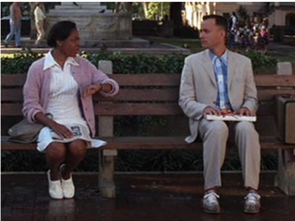
Forrest Gump speaking at the bus stop with an African American nurse

Revealing about this approach is first of all that the film sequence is described in a basically open, positive way. Equally striking—and also an expression of his professional point of view—is the variety of details that the film studies scholar recalls, interprets in terms of their symbolism, and explains. The aspect to which he pays the most attention has to do with the framing plot: the action, how and where Forrest Gump tells his story.