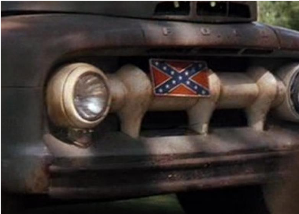
Forrest Gump pursued by a truck with a Confederate flag FORREST GUMP, DVD Paramount Home Entertainment © original copyright holders

The Germans asked focused less on the progress narrative and they frequently confuse football and baseball. Characteristic here is that they include American racism in a highly moralized discourse where perpetrators and victims are clearly identified. 26