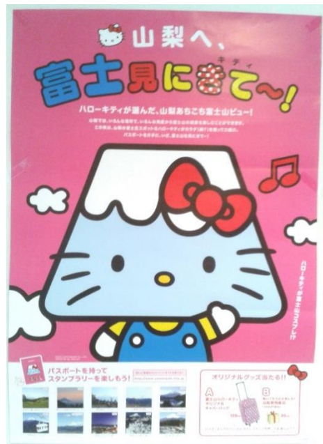
Fig. 1: Kitty ›as‹ Mount Fuji—›narrative incoherence‹ taken to the extreme; only one of the innumerable ›masks‹ or ›roles‹ Sanrio's iconic kyara adopts throughout its countless representations

diegetic contexts. The intuition that Kitty, and the many other entities typically discussed as kyara , might be something ontologically different from the usual suspects of transmedial character theory (such as Sherlock Holmes, Batman, or Luke Skywalker, cf. ROSENDO 2016) is rather based on the (over)abundance of competing and utterly incoherent information.