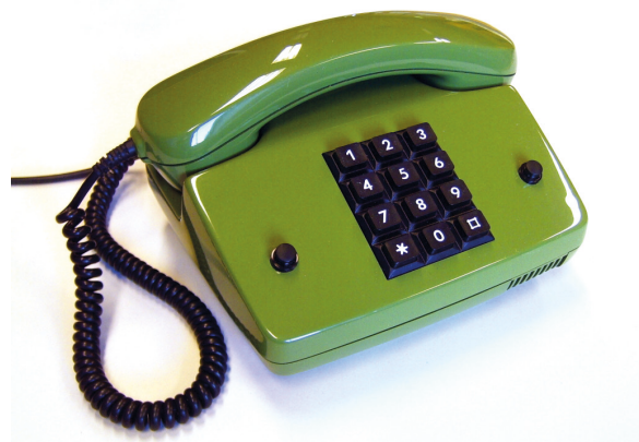
Fig. 2: Fernsprechtischapparat 75.

The Bundespost organised the services and the production of all necessary equipment. Phones, cables, amplifiers etc. were produced or supplied by a strictly limited number of companies such as Siemens or Telefunken. In most cases, customers could only buy or hire their equipment from the Bundespost which at the same time formed cartels with national equipment producers. In the 1960s and 1970s, these cartels gained in strength due to an enormous increase in the number of private phone connections and a growing range of equipment. The 'Fernsprechtischapparat 75'—a standard model offered by the Deutsche Bundespost—was adopted by millions of private households nationwide. It was a symbol of uniformity and limited choice at a time when individual expression, individual lifestyles and the freedom of choice increased in importance in German society. The Keynesian understanding of the relationship between the state, the economy and society is reflected in the design of phone models in the 1970s.