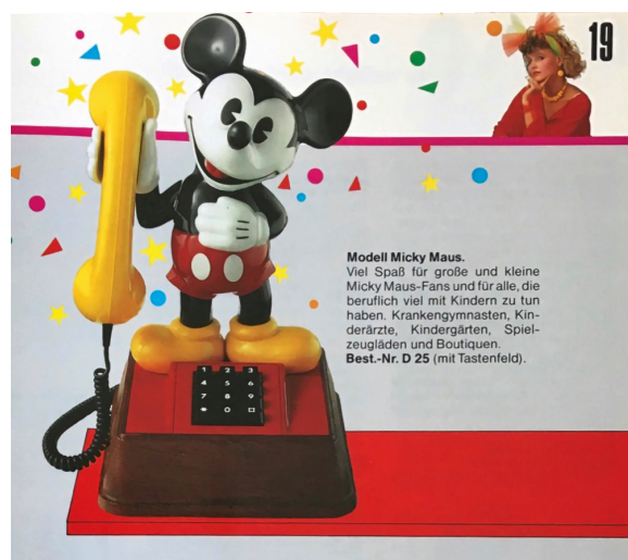
Fig. 3: Advertisement catalogue of the Bundespost in the 1980s.

Introduced by the Bundespost in June 1980, the Mickey Mouse Telephone proved to be the most important telephone within the extended offer in terms of distribution, societal significance and representation of the zeitgeist. The phone, officially named DFeAp 322 by the Bundespost, therefore embodied the tensions between the neoliberal and the Keynesian state-centred style of regulation in the telecommunication sector, the tensions within society between sociocultural norms of conformity and individualism or freedom of choice, and the tensions between the old analogue technology and the promises of digital communication. 43 The Mickey Mouse Telephone was an icon of 'individualistic' US culture, reflecting society's needs, desires and values in the early 1980s. 44 Therefore it seemed the perfect choice for the Bundespost and the intended purpose of the series of design phones. The model was advertised as fun for young and old Mickey Mouse fans and a 'must have' for all those working professionally with children. 45