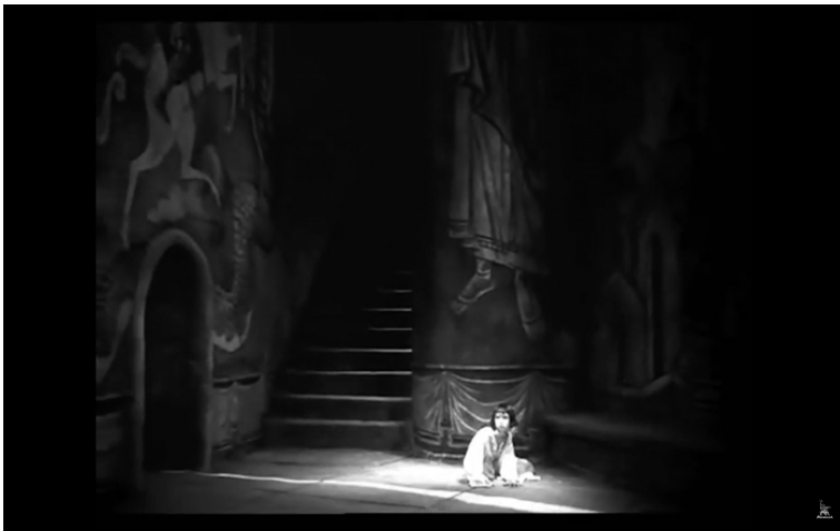
Fig. 1: Young Ivan attempting to circumvent a vast, open space right before his mother is poisoned by the Boyars. From Ivan the Terrible: Part II .