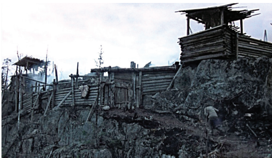
Figure 2. A screen capture from Rauta-aika showing the arrival of Väinö in the Pohjola village.

for building materials and the inscriptions painted by Ilmari had weathered away, the edges and other features of the cliff face had remained almost unaltered and were therefore still recognizable when compared with the still pictures (Figures 2 and 3) despite considerable changes in vegetation over the past three and a half decades. The fieldwork resulted in the identification of the following features.