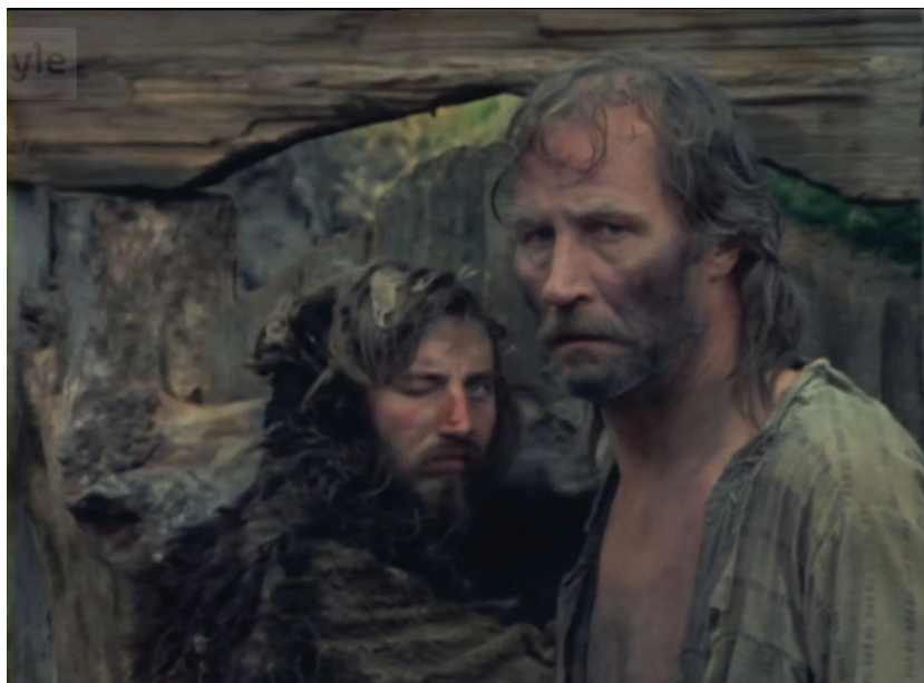
Video 2. The arrival of Väinö to somewhat brutal "Pohjola". ( Rauta-aika , YLE 1982).

The second scene set in Pohjola illustrates the difficult quest of Ilmari to forge the Sampo. The action takes place at the foot of the hill on which the village of Pohjola has been constructed. Ilmari the blacksmith and his subordinates spend a long time at the site forging the Sampo; autumn turns into winter and winter turns into spring before the goal is finally achieved. In the meantime, Ilmari has lit a large bonfire at the foot of the cliff, possibly to extract metal for the Sampo, constructed a shed for his smithy and painted hieroglyph-like inscriptions to the adjacent cliff face. After Ilmari has succeeded in forging the Sampo, the action moves elsewhere and the village of Pohjola is shown only once more in the series.