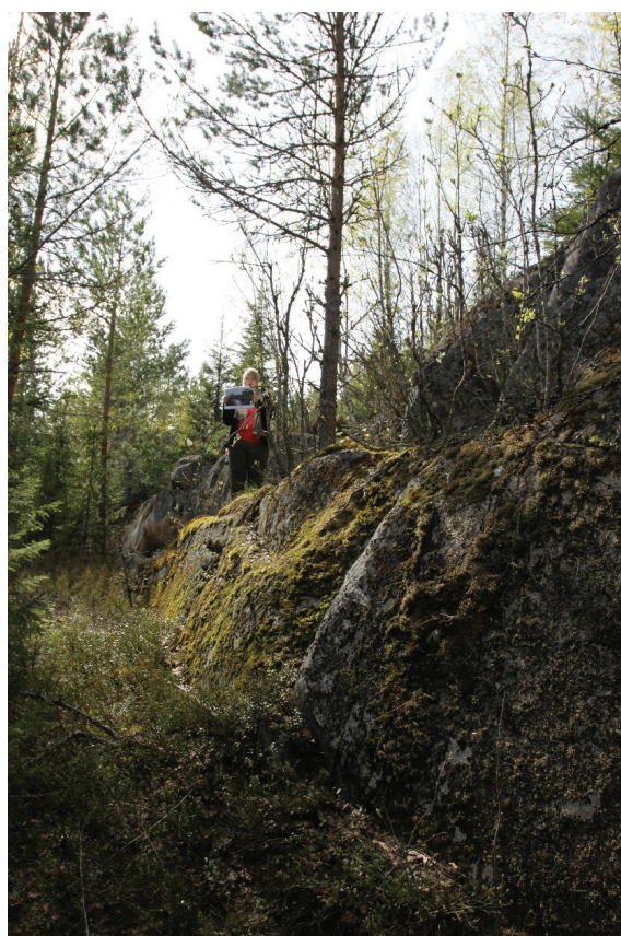
Figure 3. The section of the Seinävuori Hill where the entrance ramp to the Pohjola used to be (Photo: Äikäs).