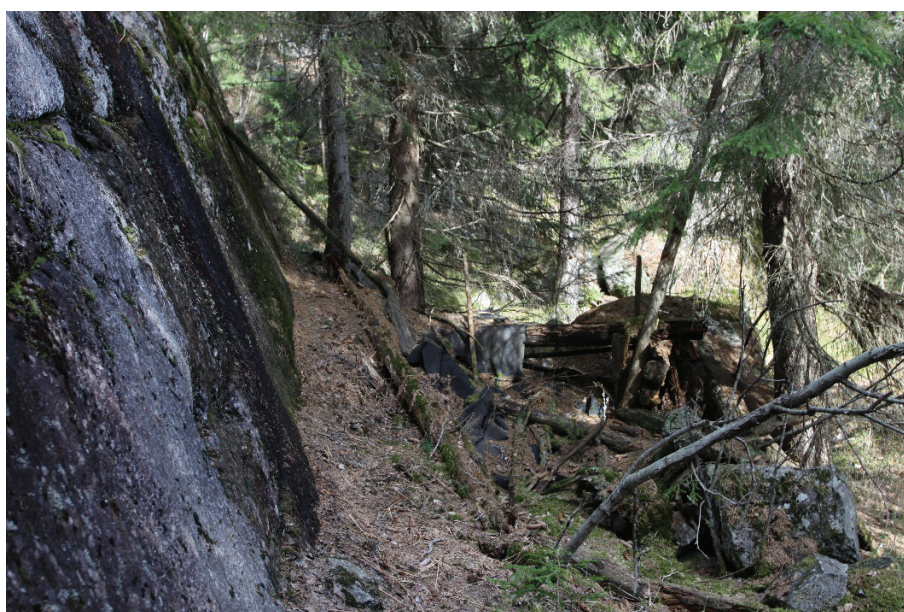
Figure 5. The remains of the smithy and the blackened surface of the cliff is all that remains from the set in figure 4.

Archaeological material that could be connected to the village of Pohjola on the top of the Seinävuori hill was even scarcer. The main entrance was identified mainly due to the steepness of the cliff; the hilltop could not be accessed from any other direction except where the gate was located. On the hilltop, the foundations of some sheds and other