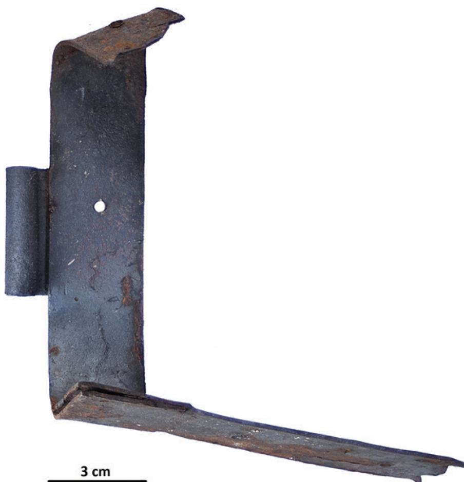
Figure 6. A door hinge found from the Seinävuori Hill.

edifices were recognizable as hardly visible shallow stone settings. Loose finds on the hilltop were also rare as they were limited to a single door hinge (Figure 6) belonging to one of the sheds. Empty alcohol bottles found on the hilltop were most likely related to a later use of the site. The very limited number of finds as well as the lack of material evidence from the structures pointed to the extensive spoliation of the site sometime between the filming in the 1980s and the visit in 2012.