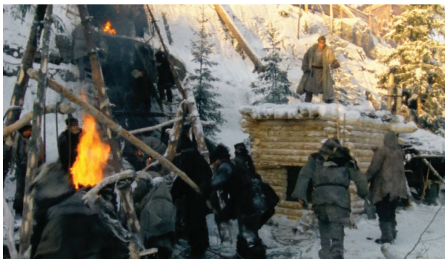
Figure 4. A screen capture from Rauta-aika with the smithy of Ilmari and the great bonfire used for forging the Sampo (YLE – the Finnish Broadcasting Company).

At the foot of the hill, the authors identified two prominent features. The first was the remains of Ilmari's smithy, of which the lowermost courses of log walls were still standing while the upper wall and the roof seemed to have collapsed a while ago (Figures 4 and 5). The second was the cliff surface against which the great bonfire had been kept by Ilmari's assistants; it was surprisingly easy to discern due to the heavily sooted cliff face. In addition, the part of the cliff where Ilmari drew his hieroglyphs was identified after a search with still pictures although the actual hieroglyphs had disappeared without a trace.