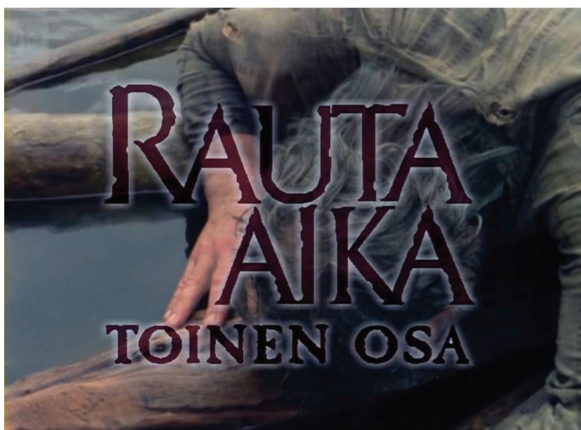
Video 3. Ilmari forging the Sampo. ( Rauta-aika , YLE 1982).

The second scene set in Pohjola illustrates the difficult quest of Ilmari to forge the Sampo. The action takes place at the foot of the hill on which the village of Pohjola has been constructed. Ilmari the blacksmith and his subordinates spend a long time at the site forging the Sampo; autumn turns into winter and winter turns into spring before the goal is finally achieved. In the meantime, Ilmari has lit a large bonfire at the foot of the cliff, possibly to extract metal for the Sampo, constructed a shed for his smithy and painted hieroglyph-like inscriptions to the adjacent cliff face. After Ilmari has succeeded in forging the Sampo, the action moves elsewhere and the village of Pohjola is shown only once more in the series.