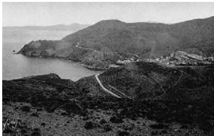
Portbou period photograph. (Leslie 2007, p. 215)

This artistic video document is a fine example of media art that points to the significance of the aura-experience in reenactment, to the cult of remembering, where the aura is hidden. For me, the video evokes the ecstasy or madness of entrance into the image in search of past time.