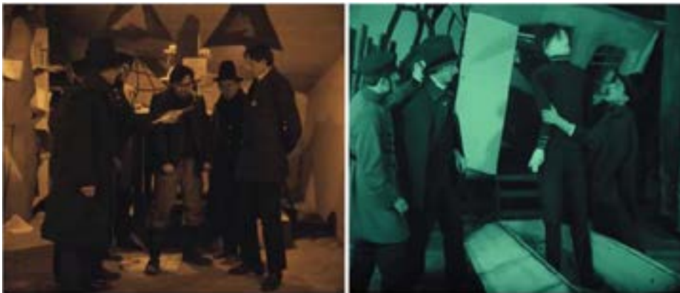
Figure 9. Left: A man is wrongfully accused of the murders in Holstenwall | right: Francis unwittingly watches Cesare's dummy for hours

The film also confounds basic temporal and ontological boundaries between the researcher and the object of investigation; in a flashback within the inner story, the asylum director reads an eighteenth-century chronicle of Dr. Caligari and is compelled not only to reenact the doctor's murderous experiments, but also to "become Caligari".