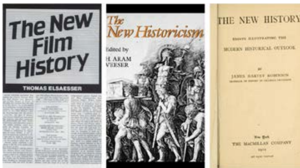
Figure 2. left: Thomas Elsaesser popularized the term “New Film History” in a 1986 article | middle: The rising New Historicism in literary studies in the 1980s | right: James Harvey Robinson championed the “New History” in the early 20th century

Of course, an analogy between the “historical turn” in nineteenth-century German scholarship and that of Film Studies in the 1980s is an imperfect one. The term “New Film History,” as popularized by Thomas Elsaesser in a 1986 article, recalled not only the rising New Historicism in literary studies, but also the “New History” championed in the early twentieth century by James Harvey Robinson, who had critiqued prior historiography for its narratives of preeminent political figures and events. 2