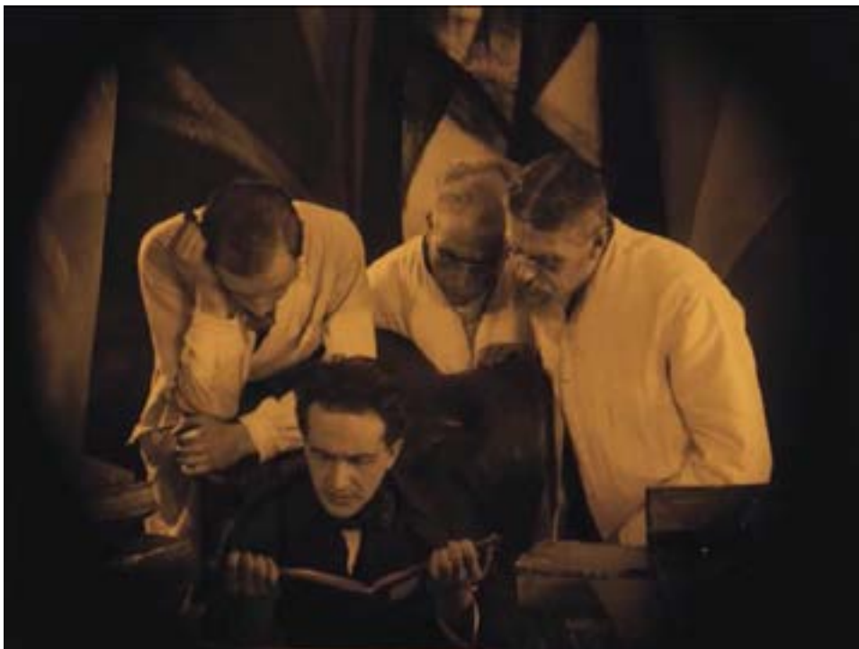
Figure 11. Francis and the asylum’s doctors scrutinize the director’s diary

Though Francis and the asylum’s doctors later unmask the director after scrutinizing his book and diary, the film’s concluding scenes disclose the dubiousness of Francis’ own story, thus undermining spectators’ assumptions based on the entire preceding action.