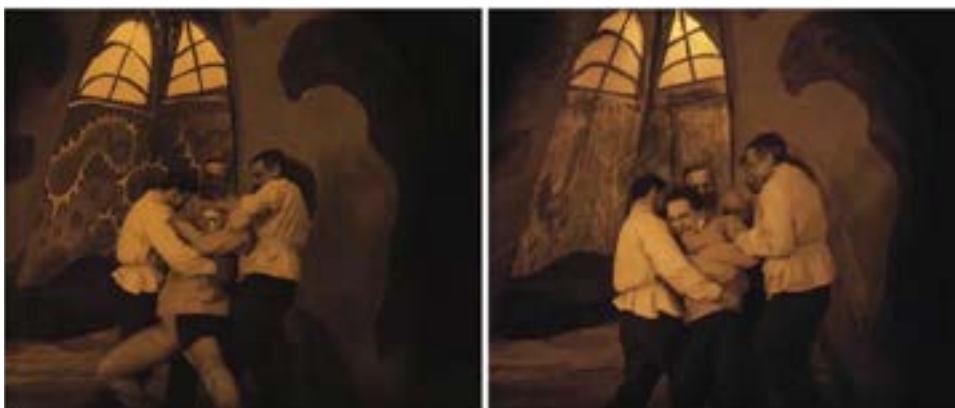
Figure 8. Left: The asylum director is captured | right: Francis is captured

The central mystery of the story within the story—who is truly responsible for the series of murders in Holstenwall—not only bleeds into and even beyond the frame narrative, resisting unambiguous resolution or closure, but is also complicated by a further question opened up by the concluding episode: namely, whether the murders narrated by Francis in fact occurred, or if the entire inner story was merely his subjective delusion. The film’s inverse, mutually incompatible endings, alternately depicting the director and Francis in straitjackets in the insane asylum, pose an irresolvable challenge to viewers’ capacity for decisive interpretation.