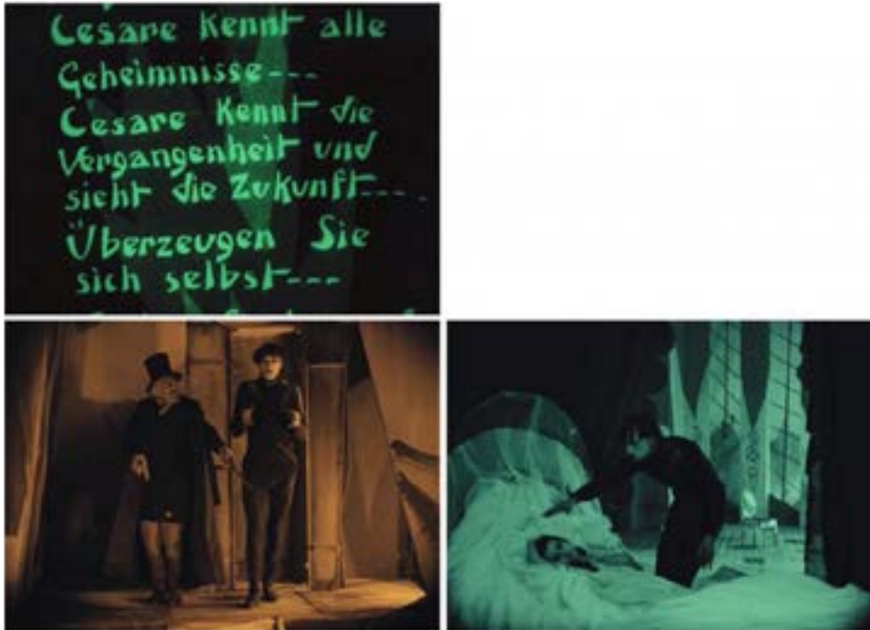
Figure 7. Top left: Cesare is hailed for his omniscient and prophetic powers | left: “Cesare knows the past and sees the future...” | right: Cesare transgresses spatial boundaries

and other. Cesare is first hailed for his omniscient and prophetic powers, which extend across temporal horizons (“Cesare knows the past and sees the future...”), and he is also revealed to transgress spatial boundaries, repeatedly exiting the fairground area and penetrating into others’ private spheres.