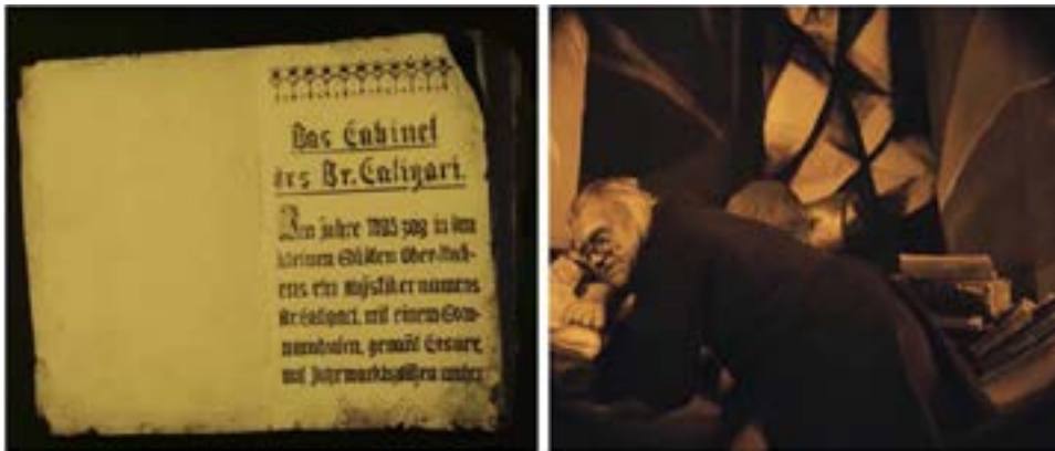
Figure 10. Left: An 18th century chronicle of Dr. Caligari | right: The asylum director is compelled to “become Caligari”

Though Francis and the asylum’s doctors later unmask the director after scrutinizing his book and diary, the film’s concluding scenes disclose the dubiousness of Francis’ own story, thus undermining spectators’ assumptions based on the entire preceding action.