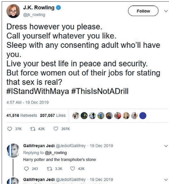
Fig. 7: Rowling's tweet from 19 December 2019 in which she supported Maya Forstater's view on sex. Screenshot.

viating social deprivation for children, single-parent families, and women. 42 Rowling's philanthropic focus may be explained by her past experiences, for she was herself a single parent. Since her success as an author has given her a public voice, she has advocated for female empowerment and gender equality. To publish her opinions, she has used different media, such as interviews with magazines or newspapers as well as speeches or social media. She was fully aware of what she was doing when she posted the tweet. To establish whether the reaction was unexpected, we can turn to the responses to Rowling's earlier posts or likes.