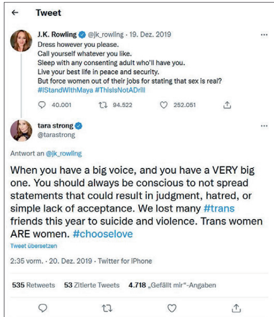
Fig. 8: Comment on Rowling's tweet wherein she supports Maya Forstater. Screenshot.

real?" (fig. 7). This tweet insisting that sex is a biological fact had sparked harsh criticism, and not only from trans-community activists. Rowling was accused of being transphobic and of denying trans people's rights. The discussion thus changed focus, from a genuine tweet on the essence of gender, sex, and gender inequality to a heated debate on transphobia, trans people's rights, and radical (and thus discriminatory) feminism. Some comments explicitly referred to the power of a person like Rowling in the public space and highlighted the responsibility that comes with that power (fig. 8).