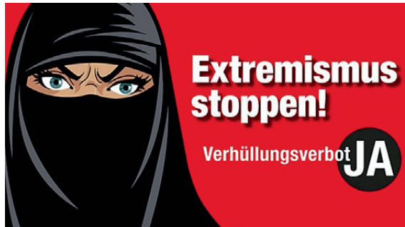
Fig. 3: Poster issued by the Swiss People's Party's at the time of an initiative to ban veiling.