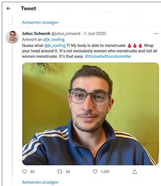
Fig. 6: Reaction to J. K. Rowling's tweet, pointing out that "women" does not mean the same as "people who menstruate". Screenshot.

I'm sure there used to be a word for those people. Someone help me out. Wumben? Wimpund? Woomud?"