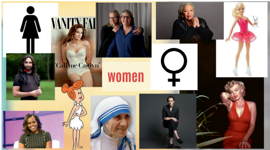
Fig. 1: The collage shows images and signs that refer to the concept of women.

As “signifying institutions”, the media provide means by which social groups produce and exchange ideas of their own values, opinions, and practices and also those of other groups. 6 Media order and inventorize the repertoire of images and ideas and thereby create normative and evaluative classifications and hierarchies. In the media, different opinions are reorganized into the “mystical unity of consensus”. 7 Media do not merely reflect this consensus, they also actively produce it. The production of consensus is only possible through conflict and closure. Media representations are always embedded within existing discursive formations. According to Hall, “These discursive formations [...] define what is and is not appropriate in our formulation of, and our practices in relation to, a particular subject or site of social activity; what knowledge is considered useful, relevant and ‘true’ in that context; and what sorts of persons or ‘subjects’ embody its characteristics.” 8 Meanings are constituted in an ongoing discursive process, in a social interaction into which every member of a language community is born and which forms the basis for the interiorization of subjective worlds of meaning. As the French philosopher Michel Foucault highlighted, power relations are shaped by communication “which transmit information via a language,