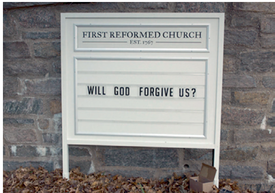
Fig. 4: Film still FIRST REFORMED (Paul Schrader, USA 2017), 01:06:56.

communities”. 32 In other words, the relationship between media and religion is embedded in a cultural environment and not just in specific religious traditions. The medial dimensions of religion and the associated meanings interact constantly with individuals and collectives as well as with social actors and systems such as politics, economy, art, and education. While some theories of religion may assume that religion takes place within the sphere of activity of religious institutions and organizations, religious communication is not contained within the limits of religious institutions and communities. Media representations of religion wander through various social and cultural spheres and times, where they are adapted and changed. This recognition marks a conscious departure from the assumption that religious institutions are largely responsible for the theoretical determination of religion and that the loss of power by these institutions causes a direct loss of religion. The point here is not to question the validity of theories of secularization, but to examine other forms of religious presence in culture.