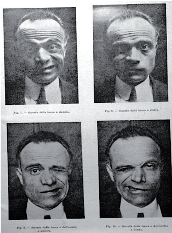
Fig. 2: Azzurri's visualisation of his muscle exercises, aimed at improving the mobility of facial expressions

historical value of their works, Italian pedagogues of film acting were more normative than descriptive in their theory. Their consciousness of the specific nature of film acting was not accompanied by a renewed theoretical horizon. Nevertheless, their works show how early and silent cinema tried to shape its own identity under the influence of other arts.