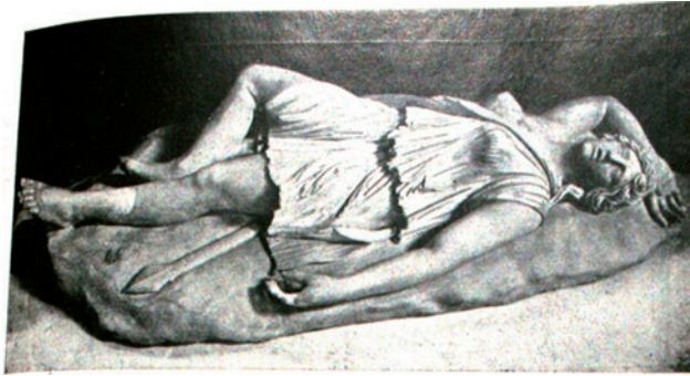
Fig. 1: The importance of statuesque iconography in defining the acting style in Guerzoni's handbook

ness of gestures, statuesque and pictorial poses, facial mobility and a kind of acting based on dramatic situations or the representation of passions rather than the definition of character. 20 In some cases, film actors are supposed to have abilities of self-direction as well: they have to control their position in relation to other actors and they have to pay attention to their exposure to light. 21 Moreover, the ideal actor should be athletic, be able to care for his/her make-up and be able to die in a proper way (fig. 1).