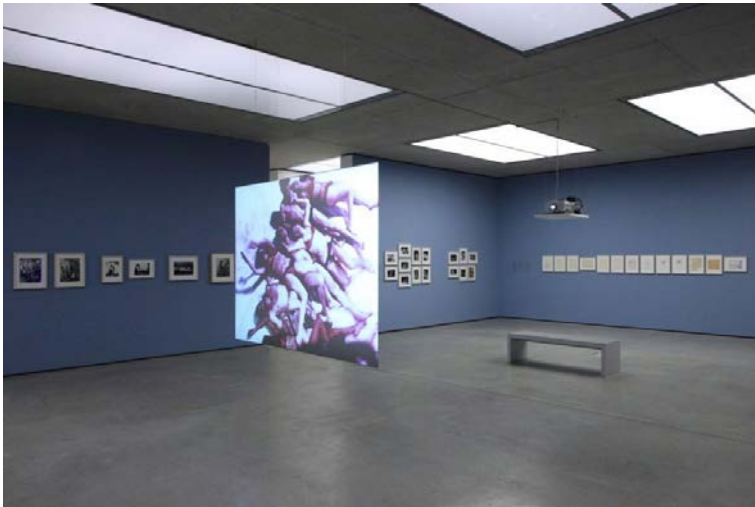
Fig. 1: Carolee Schneemann, Installation View, Kinetic Painting 2015.

rist Bill Brown names a ‘material unconscious’: a ‘referential excess’ and ‘formalizing pressure’ of one medium onto others, ‘where the relation between the visible and the invisible, the material and the abstract, things in space and space itself, might be materialized’.[1] Throughout Schneemann’s multi-media oeuvre, painterly expression materializes the kinetic strokes of sensory experience and bodily encounters that beget, as Branden W. Joseph argues, ‘an ethical relation to the other [that] constitutes one of the most significant stakes of Schneemann’s art’.[2]