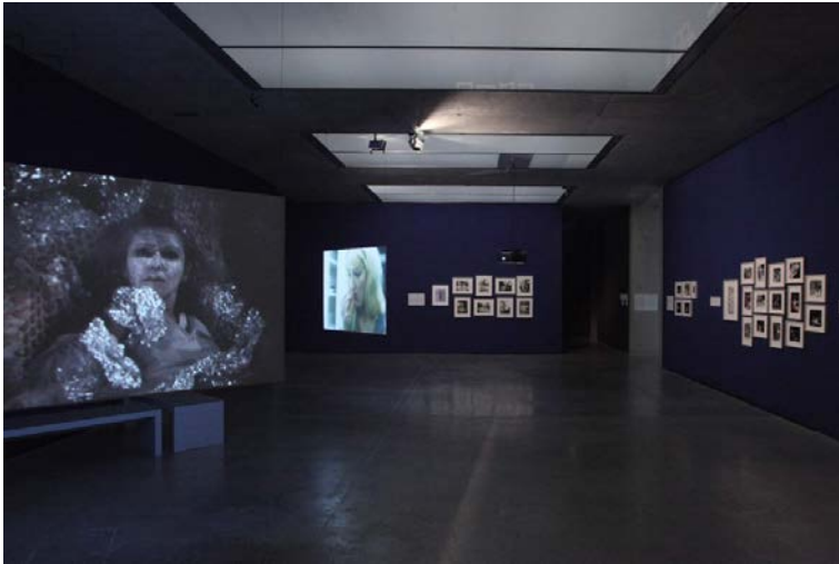
Fig. 3: Carolee Schneemann, Installation View, Kinetic Painting 2015.

Like Kittler, one might lament the loss of media individuality and the reduction of supposed phenomenological authenticity through digitisation. However, Schneemann resists this interpretation and considers the digital transfers as originals. As she maintains in a recent interview regarding the digitisation of Fuses :