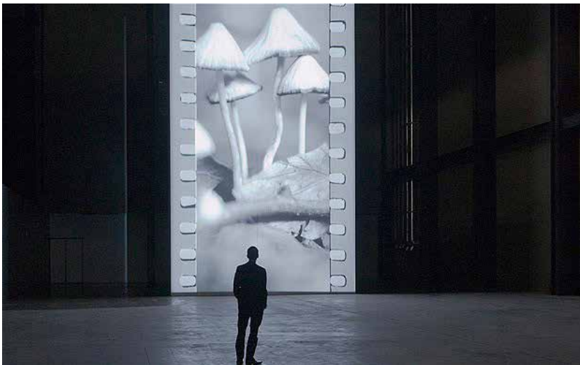
Fig. 9 A viewer marvels at FILM inside Turbine Hall

Eilean Hooper-Greenhill has drawn attention to the importance of exhibition space in her study of contemporary exhibitory practices. As museums attempt to be less formal and authoritative, they create more immersive possibilities and thus encourage visitors to engage with their material on many levels. This is especially characteristic of the post museum , a concept that Hooper-Greenhill applies to museum spaces that aim to challenge visitors' visual expectations: '[f]ormally austere spaces, established as sites for the use of the eye, have been reinvented as spaces with more colour, more noise, and which are more physically complex.' 57 Whereas the empty space of Turbine Hall may not immediately invite the same level of engagement as exhibition environments that continually employ the use of screens, projections, and sophisticated touchscreen technology, it still stands in contrast to the formal layout of the modernist museum, which advocated strict classification schemes and a 'look but do not touch' policy. Turbine Hall is a malleable space that adapts to the needs of each featured artist, many of whom want visitors to engage with their works on a personal, embodied level (Fig. 9).