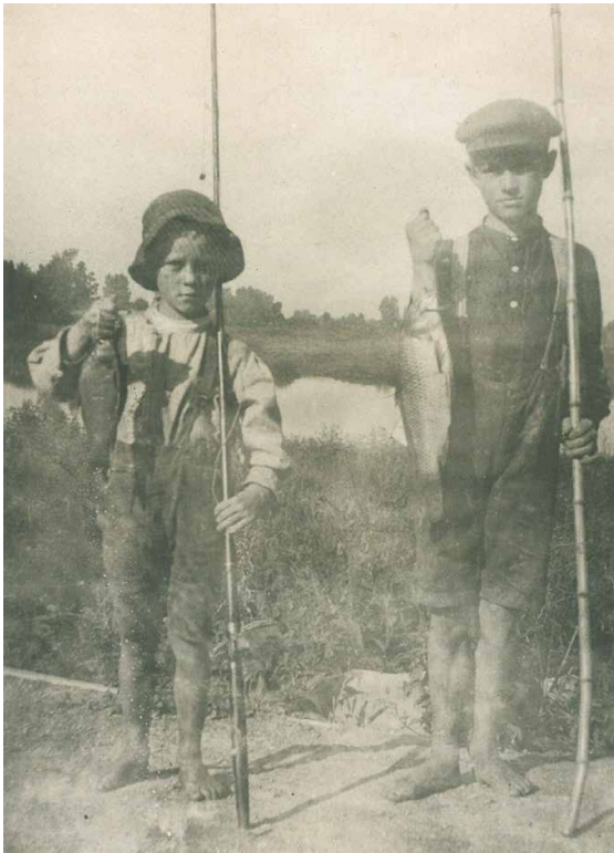
Fig. 6 A fingerprint lingers upon the face of the boy on the left