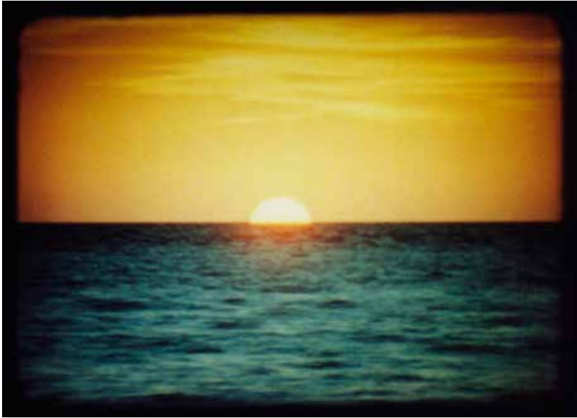
Fig. 1 Dean captures the green ray

the last green ray, but rather demonstrate how the images are inherently and visually different even though they depict the same scene.