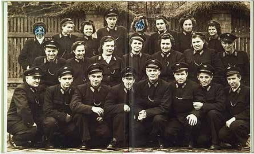
Fig. 5 Ink mars the faces of two female officers