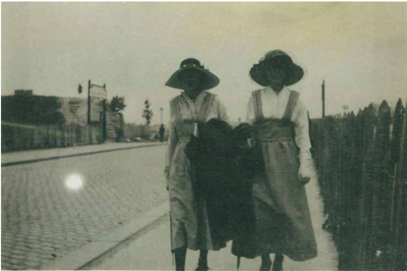
Fig. 4 Are they the same young women?

Similar to the layout of FLOH , patterns do not immediately emerge from the subject matter in the photographs. The book opens with two 5×7 inch im-