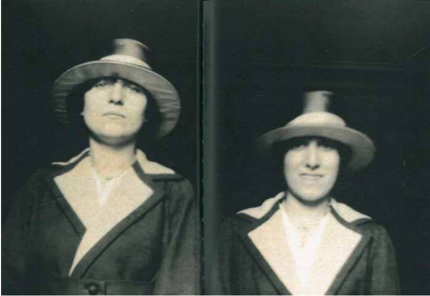
Fig. 3 Two young women at the beginning of FLOH