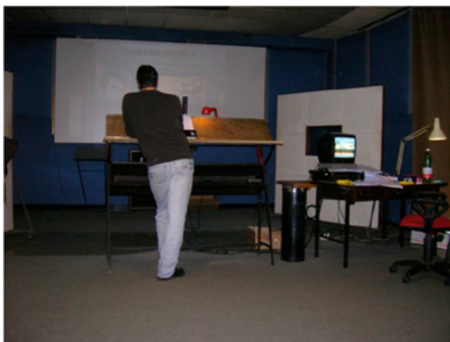
Fig. 4. The dubbing room during work on an episode of The Simpsons

Dubbing facilities are usually composed of two spaces with different functions. In a soundproofed ‘dubbing room’ ( sala di doppiaggio ), the dubbers record their lines under the dubbing assistant’s watchful eye. In the ‘control room’ ( sala di regia ), the dubbing director supervises operations, and a sound technician operates the recording machines. Between the two spaces, a glass panel reveals what is happening on screen, and microphones make communication possible when needed.