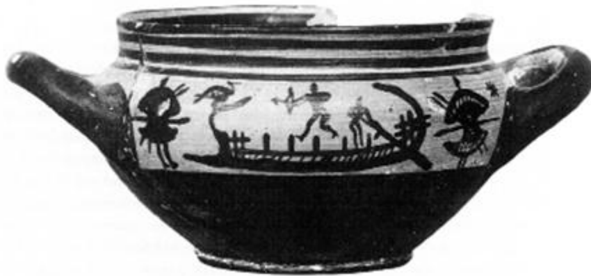
Fig. 3: Attic skyphos, about 770 B.C.; Eleusis, Archeological Museum, Inv. 741 (GIULIANI 2003: 68)

A picture of Pinus sylvestris depicted in a botanical textbook is a representation not of this or that individual pine tree but of any optional instance of this certain species. The antelope of bushman paintings is any antelope which is remembered, expected, addressable as ›an‹ antelope, the figures of hunters are any hunting bushman group in the past, present and future. The representation in its formal character is essentially general. Within a picture, generality becomes manifest, inserted between the individuality of the pictorial instance and their depicted instances of the real world. (JONAS 1961: 167f., translation S.Z.)