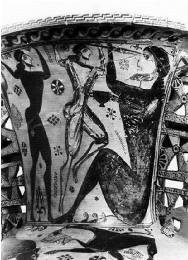
Fig. 4: Odysseus blinding Polyphemus; proto-attic amphora, about 670 B.C.; Eleusis, Archeological Museum (GIULIANI 2003: 99)

In the terminology of Giuliani (2003), the existence of a common context and the interaction of the depicted characters represent a transition of purely ›descriptive‹ to ›narrative‹ pictures. Slightly modifying the definition by Lessing, ›narrative‹ here is defined as a representation of protagonists acting as subjects who affect the course of events, the latter being confined by a thrilling moment at the beginning and an end (cf. GIULIANI 2003: 35). All these characteristics apply to the depiction on a proto-attic amphora (fig. 4), discussed in this respect by Giuliani (2003: 96ff.): Here, by means of using an unconventional weapon and the striking size of the man attacked, it is clear that not an ordinary but a particular scene is represented. Against the background of knowledge about the Homeric epics, the depiction of the wine cup in the hand of the big figure gives a further hint for identifying the presented characters: It is Odysseus with his men blinding the one-eyed Polyphemus who was cunningly made drunk and asleep before by a cup of wine.