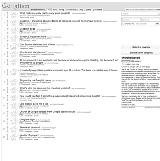
The Church of Google's Reddit Community. Accessed: March 22, 2016. www.reddit.com/r/churchofgoogle/

In an era marked by information saturation and social media, it is only natural that religious self-expression and representation online has become an accepted aspect of religious practice and identity. Leveraging the advantages of social media is The Church of Google whose members are spread across a diversity of social platforms. The two most prominent are (1) Facebook with