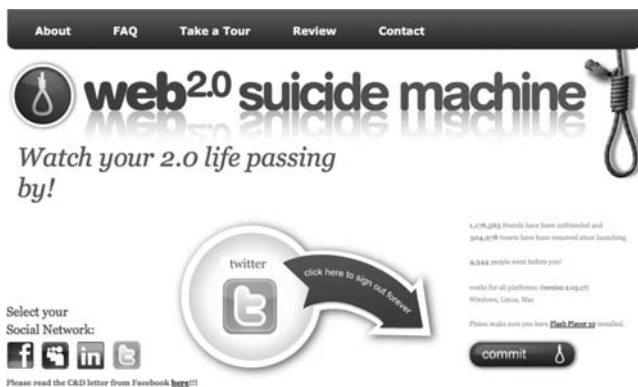
figure 3: Moddr, Web 2.0 Suicide Machine (2010). http://suicidemachine.org/

It is with an understanding of cycles of struggle that much media activism tries to adapt to the prevailing conditions, not least to respond to how communication technologies have changed the political process and the ways in which dissent can be expressed. In the case of social media activism, this is plainly evident in new strategies of refusal (sometimes referred to as ‘exodus’: an act of resistance towards constituted power, not as protest but defection). For instance, the Moddr Suicide Machine 2.0 is a good example that reflects the fashion for ‘unfriending’ from dominant social networking platforms (in its case, from Facebook, MySpace, twitter, and LinkedIn). The website explains: “Liberate your newbie friends with a Web 2.0 suicide! This machine lets you delete all your energy sucking social-networking profiles, kill your fake virtual friends, and completely do away with your Web 2.0 alterego.” The program logs in to the user’s account, changes the profile picture into a pink noose, and the password (in case you are tempted to resurrect your profile), then proceeds to delete all friends, one by one.