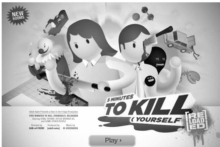
figure 2: Five Minutes to Kill (Yourself) , first developed by Ham in the Fridge (2009). http://www.haminthefridge.com/five-minutes-to-kill-yourself-family-reunion/

There is undoubted currency for the subject of virtual suicide in cultural production. Alongside the experience of virtual death and dying in commercial game worlds like World of Warcraft (Klastrup, 2008), there are many that involve first person narratives about suicide. For instance, one popular example is Five Minutes to Kill (Yourself) , a free online flash game (also available for iPhone), in which the protagonist (Stan/you) has five minutes in which to kill him/yourself rather than go back to work (2009). As the marketing material puts it: “Stan has five minutes before another soul-snuffing office meeting and his only escape from professional obligation is sweet, chilly death....You’re Stan’s only hope.” The task is to explore the office space and find ingenious ways to hurt yourself—encountering a biohazard is one such opportunity to assist in the pursuit of death. Moreover, the mise-en-scène is violent but so too the symbolic violence of the capitalist workplace.