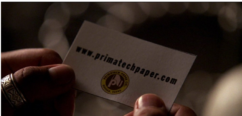
Fig. 1: Screenshot of business card close up from Heroes S01E12 (»Godsend«)

(see fig. 1). At this point of the TV narrative, the audience already knows the name of Bennet's company—the only reason for this invitational close-up is for people to go online and try out the web address. This is even more evident given that we never see Mohinder actually visit the homepage. Christy Dena understands this scene as a »catalytic allusion«, which »can have two functions: they can simply operate normally as part of the non-interactive discourse, or they can succeed in being recognised and acted upon as a catalyst for action« (DENA 2009: 310). Assuming the allusion worked and the audience followed the invitation, they found a homepage that let them browse through company information, etc. It was very reduced in style as well as information and the design looked outdated for 2007.