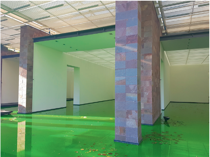
Fig. 7: Changing and animated rooms – what else is life?

Walking across the footbridges through the exhibition requires some concentration if you don't want to get wet feet. It's up to you which way to turn first, to see where the path will lead you. Maybe you have to turn back,