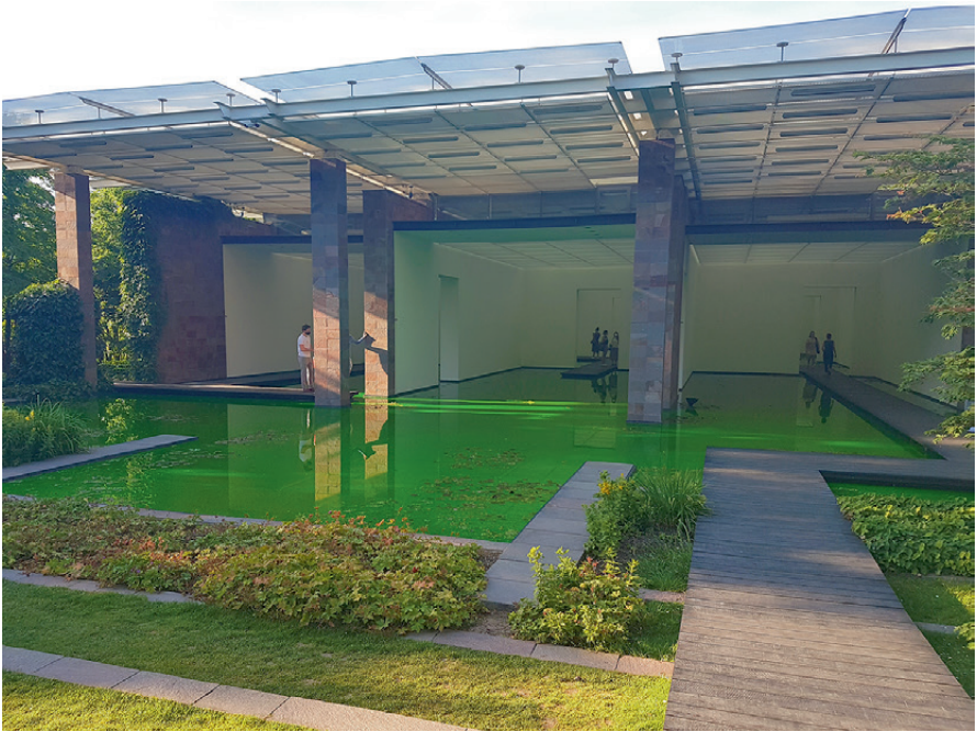
Fig. 1: View from the lawn of the exhibition inside and outside the Fondation Beyeler, Basel.

life; it is coexistence with other human and non-human beings, with nature. In this sense, the question “What is a human life?” cannot be answered without including all that makes human life possible, without seeing beyond one’s nose. We should have learned that in the time of the pandemic.