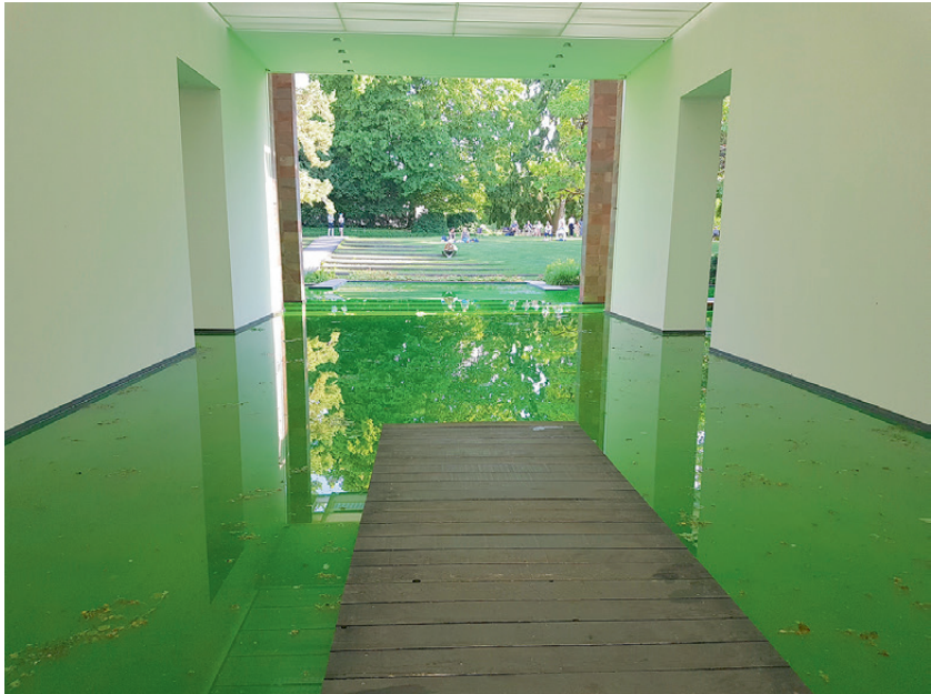
Fig. 6: Where and when does life come to a stop? Does it ever stop?