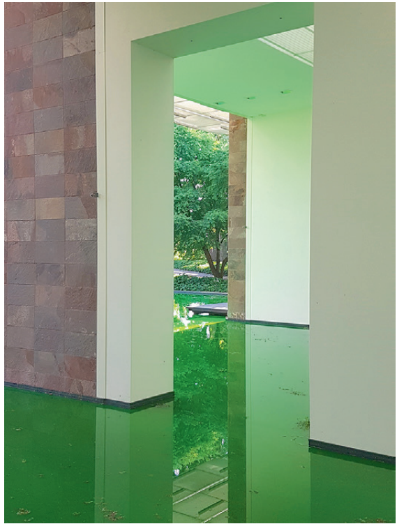
Fig. 4: Inside and outside blur, nature and culture come together.

for virtual visitors was provided by the Fondation on the exhibition website 2 .