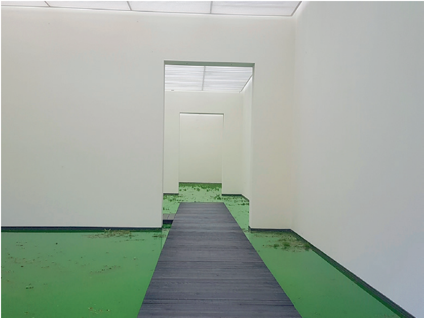
Fig. 2 and 3: The wooden footbridges over the lime-green water that floods some of the exhibition rooms of the museum.