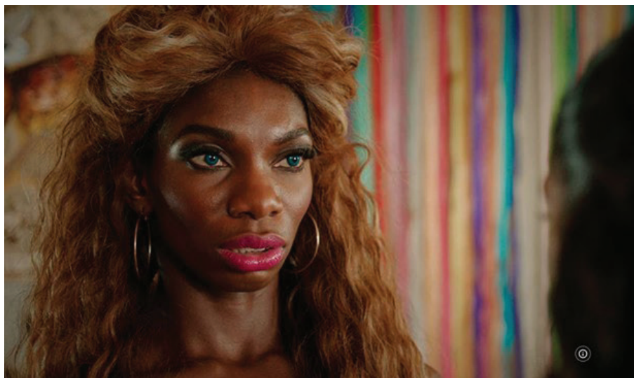
Figure 1. Season one episode one of Chewing Gum. Tracey has just received a makeover by her best friend, Candice.

In Chewing Gum , Tracey's interest in exploring her sexuality, despite her mother's wishes for her to maintain celibacy, serves as the show's most prevailing and comical narrative. Much of the show's first season is filled with scenes of Tracey drifting off and imagining her own vibrant sex-life. In the show's opening scene, Tracey imagines herself and Ronald dry-humping and licking each other's faces—what she perceives as a major sexual act, and her primary understanding of sexual intimacy. Because of her limited sex education and stunted social development, Tracey's exploration of her sexuality is riddled with misinformation regarding sexual health and anatomy, and awkward missteps that make sex less of a seamless intimate act for her partners, and more of a moment of extreme second-hand embarrassment. In an effort to come across as more appealing to Ronald during their upcoming date, Tracey is given