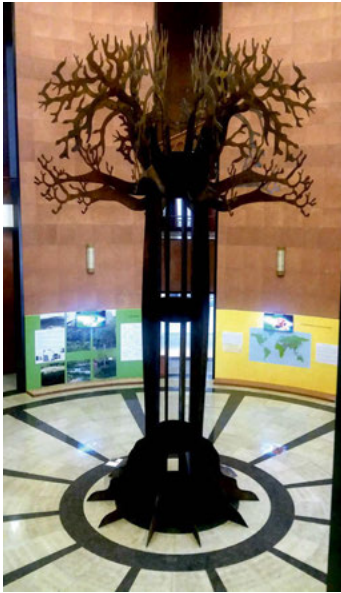
Fig. 3: Baobab, Édouard Duval-Carrié Atrium of the Musée des civilisations noires (Dakar 2019).

During the Q&A session, one of the most poignant questions was posed by a young Senegalese art teacher in the audience. »What place will be given to contemporary African production, labelled as crafts ( artisanat ), in these new African museums? How will these institutions read, deal with, and preserve such practices?« she asked. Simply put, these questions summarize a number of issues regarding African museology and art history addressed by the symposium. On the one hand, they encompass an art perspective that challenges the logic of value attribution based on the primitivist (and formalist) legacy. On the other, they problematize the very concept of art that guides the foundational narratives behind this long-awaited museum.