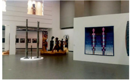
Fig. 8: Maintenant l'Afrique Installation shot, Musée des civilisations noires (Dakar 2019).