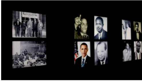
Fig. 4: Les Lignes de Continuité and Femmes Noires et la Production des Savoirs Installation shots, Musée des civilisations noires (Dakar 2019).