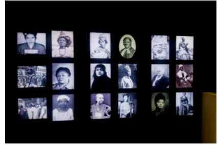
Fig. 5: Les Lignes de Continuité and Femmes Noires et la Production des Savoirs Installation shots, Musée des civilisations noires (Dakar 2019).

Pursuing the parcours of the lower left-side galleries, a section entitled Civilisations Africaines (African Civilisations) features a series of masks, statues, tunics, and other objects, presented as a sign of »African ancestry and authority«. 13 While lacking contextualisation, this gallery proceeds without further addressing the pieces' meanings (be they copies or originals) within the museum, or their role in Western and African art historiography. As the visitor continues to walk along the ground floor, a set of illuminated portraits emerges against a dark background. Titled Les Lignes de Continuité (The Lines of Continuity), it shows a number of black leaders, from Kwame Nkrumah to Barack Obama, and Frederick Douglass to Nelson Mandela. On the first floor, a similar display is dedicated to women: Femmes Noires et la Production des Savoirs (Black Women and the Production of Knowledge). Among the series of portraits, a photograph of American activist Rosa Parks (1913–2005) 14 stands out. The representation of Parks and the great figures of pan-Africanism in the installation, included in the parcours of the MCN, immediately led me to associate it with one of the works exhibited in the seventh edition of the Dakar Biennial (2006), where the Senegalese artist Ndary Lo (1961–2017) chose to celebrate »the refusal of Rosa Parks«.