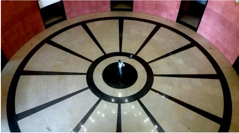
Fig. 2: Atrium of the Musée des Civilisations Noires (Dakar) three months before its opening (September 2018).

architecture and their meaning, they transmit messages through time to future generations« said Wade ( apud Drame 2011).