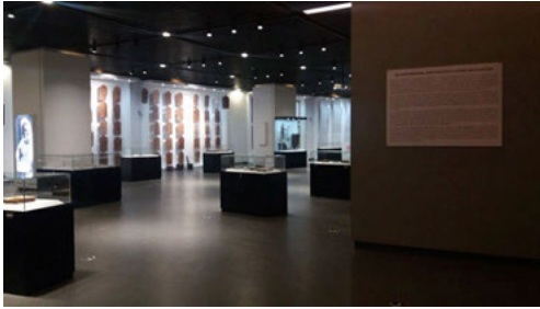
Fig. 7: Les appropriations africaines des religions abrahamiques, installation shot, Musée des civilisations noires (Dakar 2019).