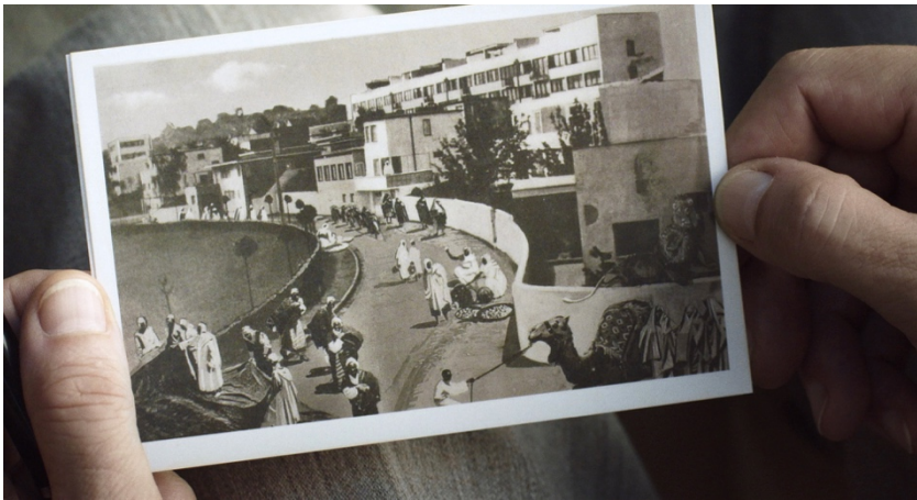
Fig. 1: Still from White City . Camera: Itay Marom. Courtesy: Dani Gal, Pong films, and Gallery Kadel-Willborn.

determining peoples' movements. The white fingers that refuse to be cropped out of the frame draw attention to the white border in this image, which is often overlooked. The white frame invokes the genre of documentary photography. However, this photograph did not in fact document anything indexically. Instead, as mentioned in my introduction, the figures are superimposed on an image of Stuttgart that is framed in the form of a postcard doctored by the Nazis. The doctored image upends our typical expectations of encountering stills in film as marking what 'has been'.