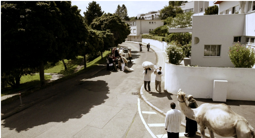
Fig. 4: Still from White City . Camera: Itay Marom. Courtesy: Dani Gal, Pong films, and Gallery Kadel-Willborn.

woodwind flute at 21:15 creates a powerful contrast. This contrast draws our attention to the way European culture co-existed and clashed with Palestinian Arab culture. By juxtaposing the two types of sounds (the European classical piano and Arab electronic music), we again think of the colonial migration of aspects of European culture to Middle Eastern spaces. While the music plays and Ruppin walks, we see the live scenes captured in the photographs on the postcards with which White City begins. However, rather than moving straight from the image with people to the one of the empty spaces in Stuttgart, as is the case with the filmed postcards in the opening, we now see the Palestinians loading themselves as well as their belongings into a truck that a man in uniform drives up to the street (Fig. 4).[38] At this point, the piano music stops and we hear Barakat's electronic music in conjunction with field recordings of a Muezzin and people chatting from an Arab city. Furthermore, as the color from the first part of the scene fades, and the music softens, we do not see Stuttgart as empty but with Ruppin walking through the street, his back facing the camera.