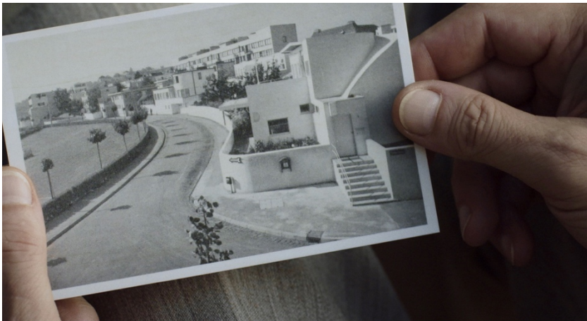
Fig. 2: Still from White City . Camera: Itay Marom. Courtesy: Dani Gal, Pong films, and Gallery Kadel-Willborn.

the image, White City exemplifies how hegemonic forces, in this case the Nazis, used photography to construct manipulative counter-memories. According to Roland Barthes, ‘counter-memories’, are photographs that ‘block [actual] memory’ and instead create new contradictory ones.[19] Rather than documenting truth, photographs as counter-memories obstruct actual memories of events and instead become representations of alternative ‘memories’. The multifaceted and multidirectional construction of counter-memories becomes more apparent during the transition to the later version of the image (Fig. 2).