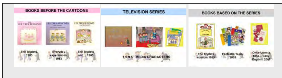
Fig. 2: Brief visual summary: from books to television screen

Figure 2 shows the brief visual summary mentioned before. It shows the differences between the work that inspired the cartoon series and the later collections.