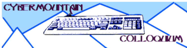
Banner for the Cybermountain Colloquium website.