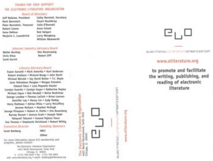
The ELO's first membership brochure (2000).

In retrospect it is almost staggering that we were able to pull together so many influential people in so brief a period. The first board of directors was very productive