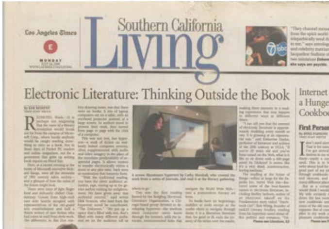
Article about electronic literature in the Los Angeles Times, May 18, 2000, based on interviews conducted after the ELO fundraising event in Seattle.