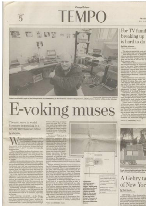
Article about the ELO in the Chicago Tribune, May 18, 2001.