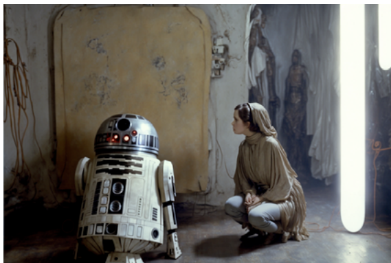
Figure 1: Still from “The AI Star Wars Project” by Oren Shved (2022)

director Andrei Tarkovski (cf., e.g., fig. 1). “The AI Star Wars Project” resembles Tarkovski’s classic Soviet science fiction art film Stalker (1979). The scenes feature austere landscapes, junkyard technology, and Storm Trooper outfits that blend with Soviet militarism. The color palette is minimalist and sober, but sometimes a warm highlight illuminates a corridor in a gray spaceship.