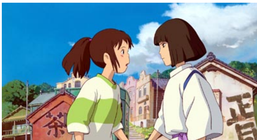
5. Chihiro and Haku as a young boy