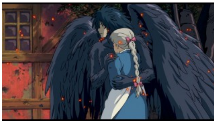
3. Howl as a bird-man bearing angelic wings, Sophie as a young girl with long silver hair