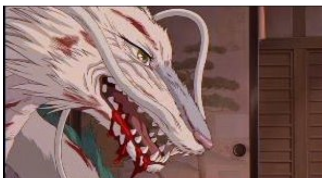
7. Haku as an injured dragon after the attack of the paper-birds