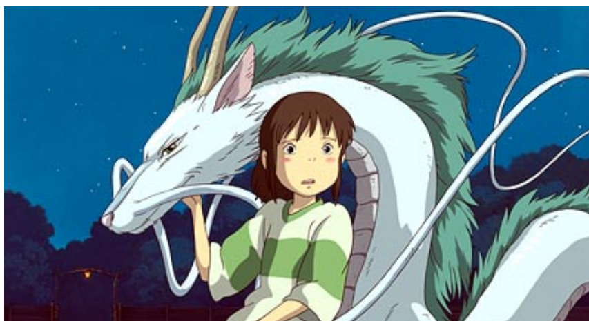
6. Haku as a slender dragon