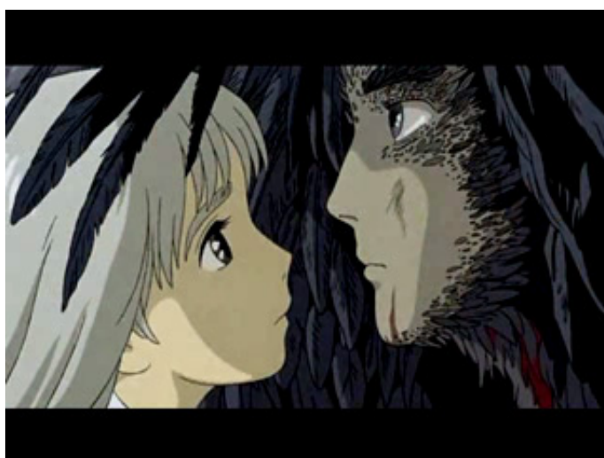
4. Howl as a defeated, frightening bird-man, Sophie as a young girl with short silver hair