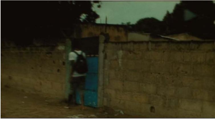
Fig. 5: A play symbol on the top-right edge throws the ontological status of the image into question.

transition precisely as its status as standing for the diegetic reality is thrown into disarray by the play symbol, which suggests it to be a reproduction of such a reality instead.