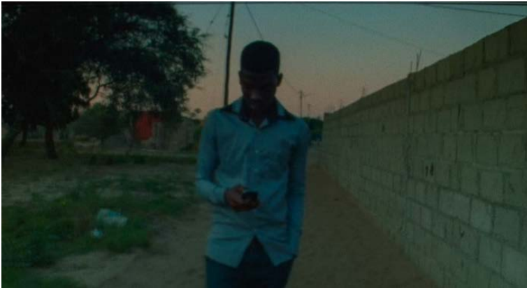
Figs. 1, 2: Youngsters walking and texting in The Human Surge .

But if millennials and technology constitute the film's focus, The Human Surge critically engages with this phenomenon by situating it in relation to class. Indeed, it is hard not to notice that all characters in the film are uniformly disenfranchised and from less than wealthy countries, often living in modest if not shabby houses, and mostly unhappy in second-class jobs, when not jobless. While at the film's start we see the Argentinean Exe working in a warehouse supermarket, a few scenes later the viewer learns that he has been fired 'yet again' for reasons unknown (even though he will reappear as a cashier in a small shop later on). In another scene in the Mozambican story, Alf confides, to their friends' amusement, that he is thinking of leaving his job. Cryptic, disconnected phrases like 'They need us to be in debt, really' and 'What are the millionaires going to do? We have to wake up early. I hope their fortunes never decline!', often uttered unexplainably and presumably ironically, further underscore the particular social class to which these youngsters belong.