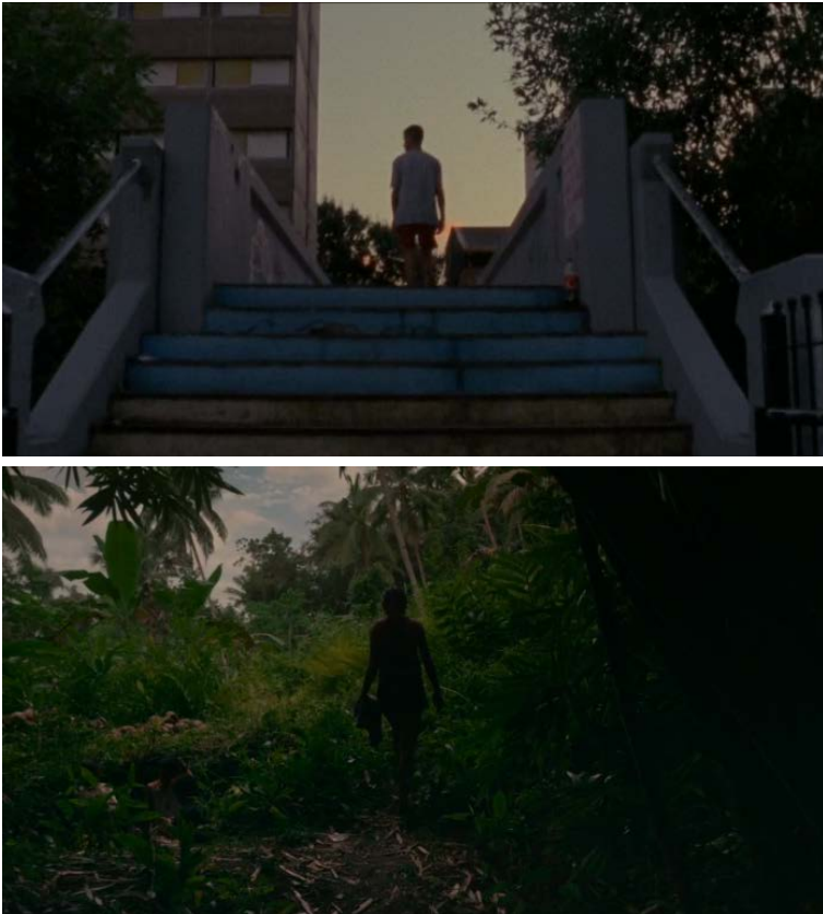
Figs 6, 7: Camera tracking characters in The Human Surge .

use of a Steadicam. On the contrary, the camera in The Human Surge is positively handheld and shaky, thus reflecting in the very constitution of the image the embodied exertion and contortions of the camera operator. This is especially the case when we consider the hilly, jagged, and sinuous paths and alleys through which the camera often traverses, which makes it difficult if not impossible to stabilise the recording equipment whose erratic movement becomes itself an index of the corporeal experience of traversing those settings.