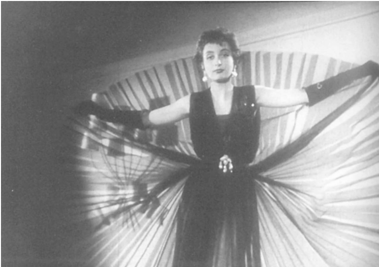
Fig. 5: Heinz Schulze-Varell's "architectural" fashion. NEUE DEUTSCHE WOCHENSCHAU Nr. 88, 1951.

haute couture. Newsreel's fashion-films displayed—at least theoretically—the economic success and cultivated taste not of husbands and fathers but of nations, showing prosperity and development not of a social class but of the nations imagined collectively as the bourgeoisie. Only in NDW's first year could fashion appear as a field of female expertise, with designer Helle Brüns, mannequin Hildegard Knef or actress Hilde Weissner. By 1951, fashion news-films were narrated by a male voice, and on the screen male designers such as Heinz Oestergaard (Berlin) and Heinz Schulze-Varell (Munich) alone—maybe with allied help—were permitted to represent West German fashion excellence. In NDW's portrayal of foreign fashion, prominent male designers appeared as the only legitimate fashion experts, as kings and dictators represented or accompanied by ambassadors: breathtakingly opulent evening gowns with names, displayed by nameless slim women.