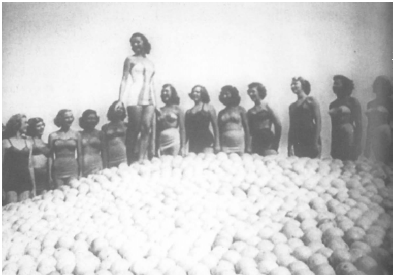
Fig. 4: “Grapefruit-Queen”. NEUE DEUTSCHE WOCHENSCHAU Nr. 1, 1950.

Some examples are presented here of how relations between nation and gender have been operating at cross-sections of discourse and imagination. As topics like industrial production, advertisement and consumption (especially fashion and beauty) across borders are particularly susceptible to being gendered, most examples have been drawn from this realm.