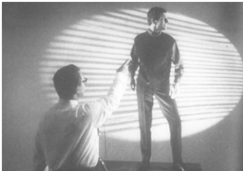
Fig. 6: Studio shooting of men's fashion. UFA WOCHENSCHAU Nr. 323, 1962.