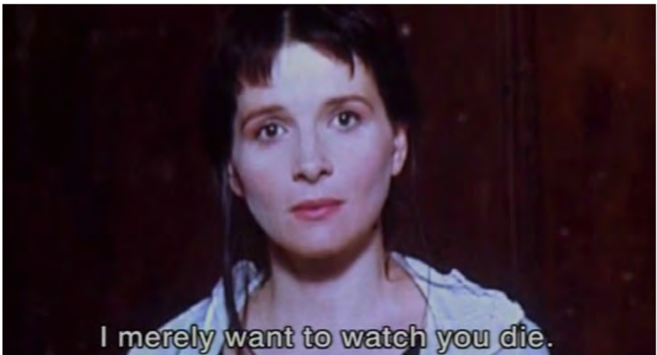
Figure 12 – Anne is trapped in the red, windowless room (frame grab from CODE UNKNOWN, Michael Haneke, 2000)

One of the scenes where Anne is acting out a dramatic part uniquely illuminates the idea that socioeconomic positioning or identity is consistently trumped by the volatile, arbitrary designs of biopower. Here, she plays a wealthy woman who is being shown a spacious, luxurious apartment by a realtor. Suddenly, she finds herself trapped and confronting a sure death in a windowless red room. The importance of this moment lies in the forceful way it extends the state of bare life to any and all bodies in the film, regardless of race or socioeconomic status. This scene announces itself as viscerally affective rather than representational. The intrusive, relentless training of the camera on Anne's face suggests a desire to dismantle the real/fictional divide by piercing through her first layer as fictional character/actor and into the real affects beneath this mask. A voice-off, supposedly the diegetic director's (Didier Flamand), takes on the lines of Anne's sadistic captor. As the male voice-over says, "The door is locked, you will never get out, you will die here," Anne's facial expression of disbelief and the panicky tone of her voice ("Sorry, is this a joke?") are so utterly convincing that the man's words are no longer part of a script (See Figure 12, below).