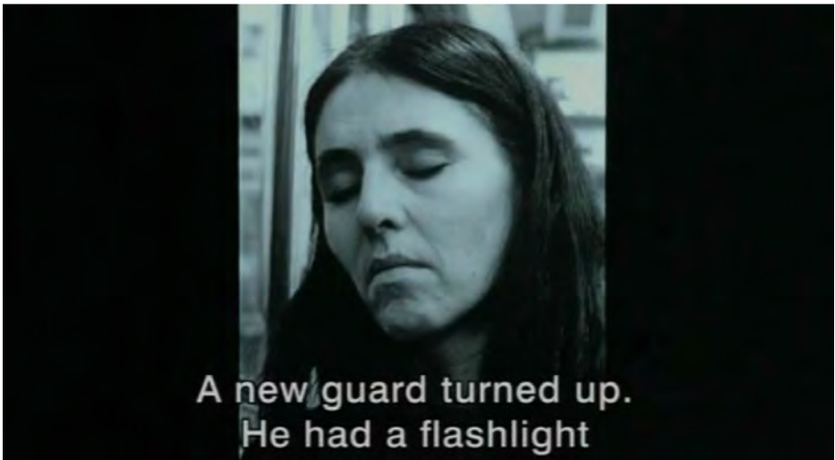
Figure 9 – Non-white faces of the French nation (frame grab from CODE UNKNOWN, Michael Haneke, 2000)