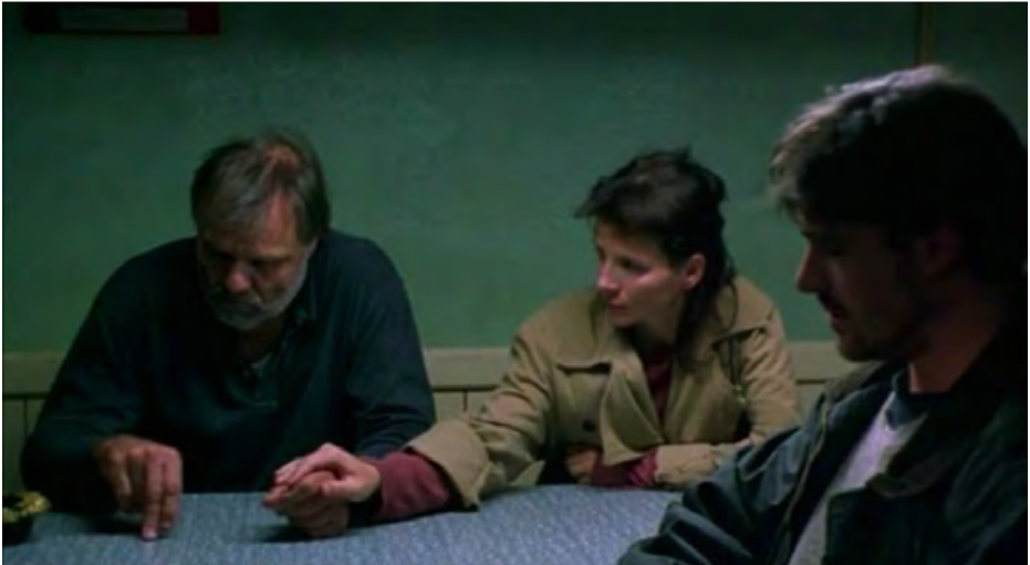
Figure 3 – Anne tries to hold Georges’s father’s hand (frame grab from CODE UNKNOWN, Michael Haneke, 2000)

(“In any case, he’s right. There’s no future here”), and recrimination of Georges for setting a bad example for Jean (“You blazed the trail for him”). Finally, the father reaches a dead-end where what he really feels cannot be articulated: “Jean will come back when he wants to, or. . .” to which Georges replies: “Or what?” As language utterly abandons the father, he starts to fidget nervously with his fingers on the tabletop. But when Anne affectionately steps in to hold his hand steady, he cannot handle her touch, excuses himself, and leaves the room (See Figure 3. Anne tries to hold Georges’s father’s hand).