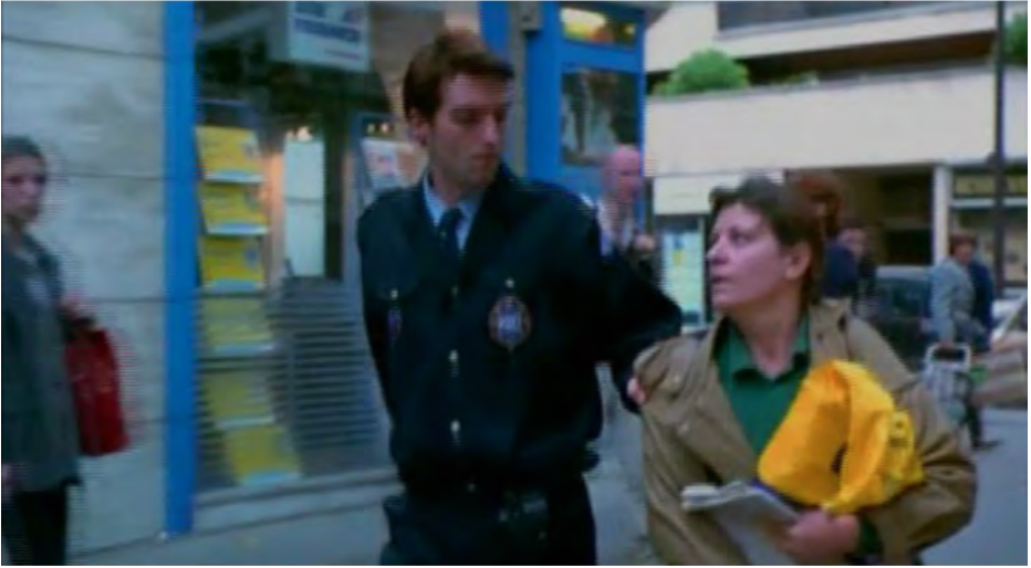
Figure 7 – A cop drags Maria along the sidewalk (frame grab from CODE UNKNOWN, Michael Haneke, 2000)

Jean. The faciality machine works as a social production of faces, and, as such, it obliterates any possibility of independence between the face and language. In other words, the face is no more able to carry an autonomous expression independently from language than language is able to serve as a conduit for transparent communication (179).