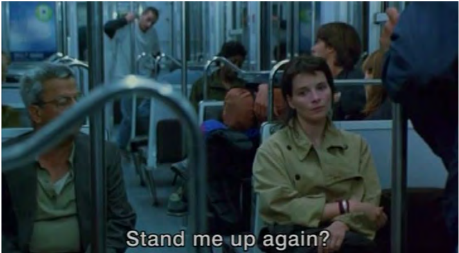
Figure 11 – Anne is harassed by the young bear, who stands beyond the right edge of the screen (frame grab from CODE UNKNOWN , Michael Haneke, 2000)

persons to a critique that exposes its own mechanisms as arbitrary and mutable. Just as the cultural judgments associated with the relations between certain faces and their socioeconomic functions are purely capricious and volatile, we can say that identity, whether of the individual or the nation-state, is purely a myth created to consolidate an elusive sense of unity or homogeneity. As Code Unknown illustrates by contrasting the denigrated Maria in the streets of Paris with the Maria who dances and rejoices at the wedding celebration in Romania, or by juxtaposing the scene of Amadou's confrontation with the police with the pleasant conversation he shares with his girlfriend at the restaurant, there is no such thing as identity, let alone an inherently or essentially violent identity. There are only multiple becomings of the subject, which are wholly dependent upon the variable field of forces in which we are situated—forces in relation to which we can either be diminished in our capacity to act, feel, or create, or augmented in those very capacities.