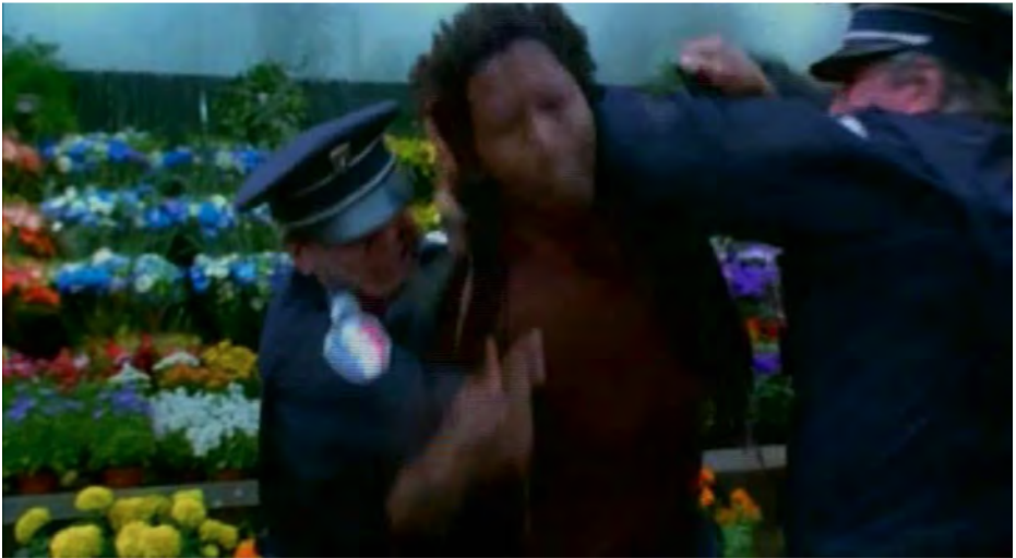
Figure 6 – Amadou wrestles with the cops (frame grab from CODE UNKNOWN, Michael Haneke, 2000)

Amadou and Maria as potentially or de facto undocumented immigrants (“sans papiers”) works as an act of instantaneous capture that dispenses with any necessity of verbal interrogation. Here, language is fascistically reduced to a matter of instantaneous capture and unconscious pairings of signifiers (black young male = trouble; female homeless immigrant = trouble). Although Amadou produces an ID card, which juridically, at least, entitles him to some legal rights, he is instantly pronounced guilty and handled as a wild force that needs to be subdued (See Figure 6, below).