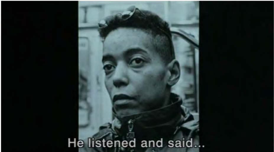
Figure 10 – Non-white faces of the French nation (frame grab from CODE UNKNOWN, Michael Haneke, 2000)

of the forces of life with the forces of the market, a system “in which everything has an equivalence in money” (Adkins 162), and it is this equivalence that produces the most insidious form of subjugation.