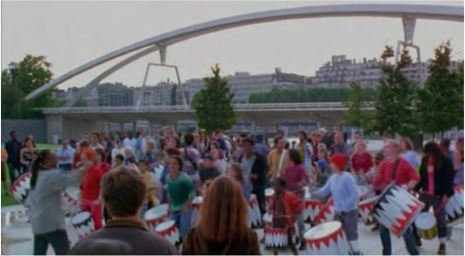
Figure 13 – Hearing-impaired children playing drums (frame grab from CODE UNKNOWN, Michael Haneke, 2000)