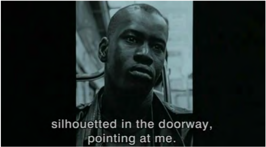
Figure 8. Non-white faces of the French nation (frame grab from CODE UNKNOWN, Michael Haneke, 2000)