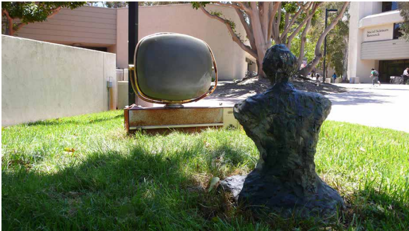
Fig. 1: Nam June Paik, Something Pacific (1986). Stuart Collection, University of California, San Diego. Installation view on the campus, May 2011.

There is a particular feeling that is attached to this observation, a feeling of tranquillity, stasis, deactivation, perhaps meditation and somewhat religious emotion. This strangely-arranged ensemble, rather than putting malfunction on display, takes the viewer to the other side (perhaps to nostalgia), questioning the standard of what is expected of media – a desire or even demand to view a transmitted image. It is astonishing in its devotion to stillness and contemplation.