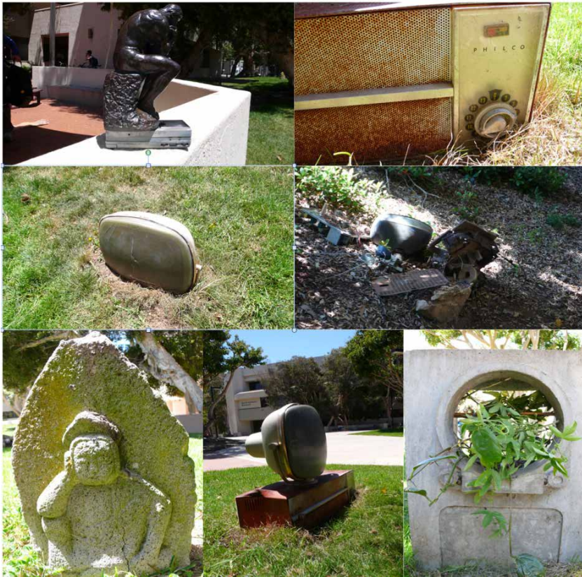
Fig. 2: Nam June Paik, Something Pacific (1986). Stuart Collection, University of California, San Diego. Various elements in the campus yard, May 2011.

Something Pacific (Figures 1 and 2) is Paik's first outdoor installation, conceived for the Stuart Collection, which is located at the campus of the University of California, San Diego. 8 The installation features a number of ensembles, including statues of Buddha and (ruined) television sets embedded in the landscape, a Watchman topped with a statue of Rodin's Thinker , and a TV Graveyard – a pile of electronic rubbish thrown out of one of the windows of the Media Center.