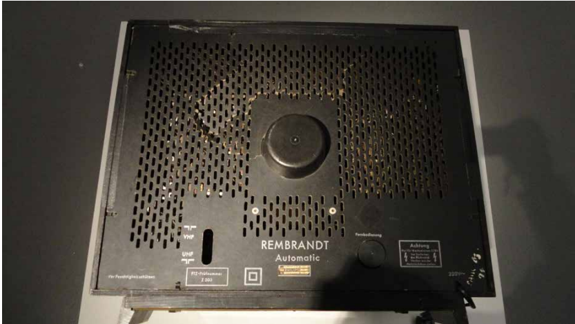
Fig. 4: Nam June Paik, Rembrandt Automatic (1963). Installation view during the exhibition Nam June Paik: Video Artist, Performance Artist, Composer and Visionary , Tate Liverpool, 17 December 2010 – 13 March 2011.

dark. When experienced nowadays its dysfunction directs the attention of the viewer to the stillness of the casing, to a certain form of concealed, yet detectable, absence.