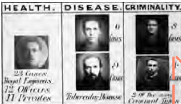
Specimens of Composite Portraiture [fragment]. Image by Francis Galton, Source: (Galton 1907).

One may ask if there exists, in a people, un homme type , a man who represents this people by height, and in relation to which all the other men of the same nation must be considered as offering a deviation (Quetelet 1845, 258).