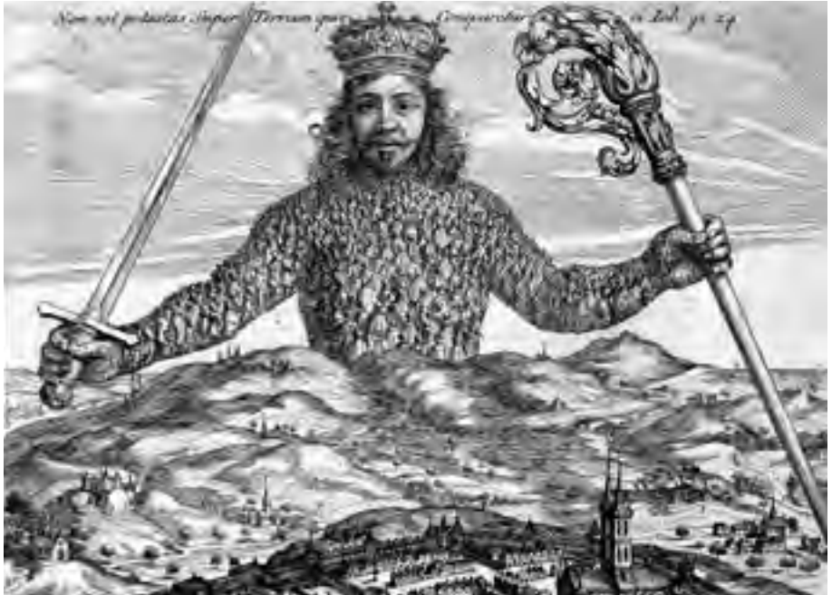
Frontispiece to Leviathan . Image by Abraham Bosse, Source: (Hobbes 1998). A multitude of men, are made one person, when they are by one man, or one person, represented; so that it be done with the consent of every one (Hobbes 1998, 98).

One may ask if there exists, in a people, un homme type , a man who represents this people by height, and in relation to which all the other men of the same nation must be considered as offering a deviation (Quetelet 1845, 258).