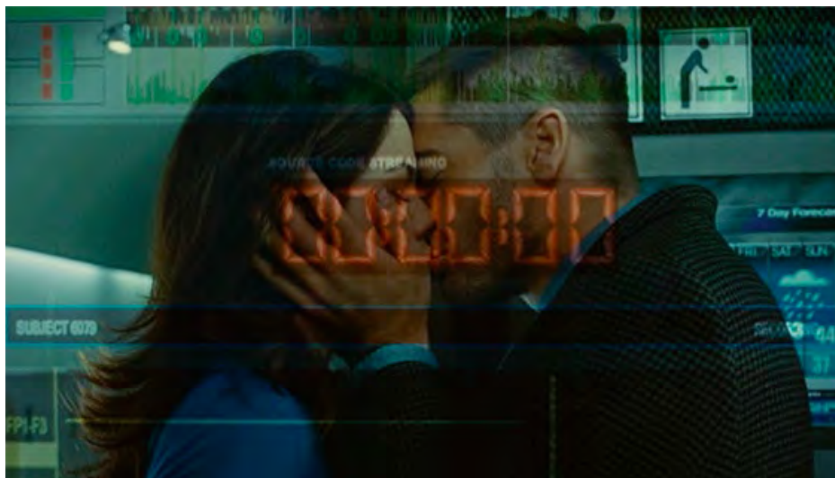
Figure 8 – The heavily mediated, disembodied life of Stevens runs out of time in parallel with his, and the audience’s, last eight-minute clip from the “Source Code” program.

Ultimately, with the second bomb threat thwarted, Stevens returns to “Source Code,” which indicates that the error-image depicted by the film may not be the dwelling in tandem for a protention to link the simulation back into the real world where the terrorist continues to plant bombs. In the final run, the error-image precipitates a still time-image of the simulation at the moment Captain Stevens’s real body dies. Unlike the deaths he undergoes in the program, which reloop Stevens back into “Source Code,” the viewer watches this “real” death as a frozen frame of the coded reality, which is slowly revealed with increasing depth as the perspective floats backwards (see Figure 8, above). This directly invokes Bergson’s pure perception, or the totality of matter-images stricken from duration. It is ambiguous whether this sequence ought to be taken as its own time-image, removed as it is from the sensorimotor continuity of action flowing from perception, or as a perception-image without movement. In this single-frame shot, the cinematic image stalls, it defaults on its