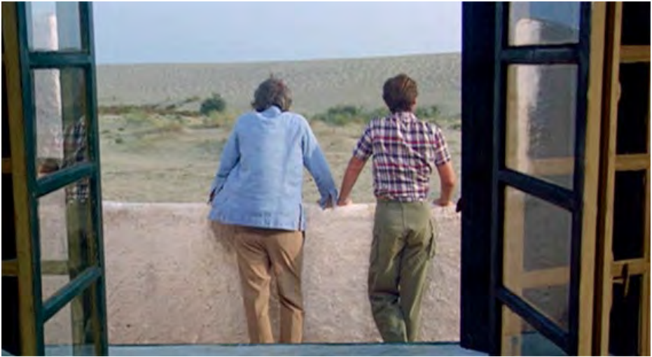
Figures 4-6 – Antonioni’s smooth direction in THE PASSENGER slips the linear progression of the camera’s gaze into a pocket of time out of joint.