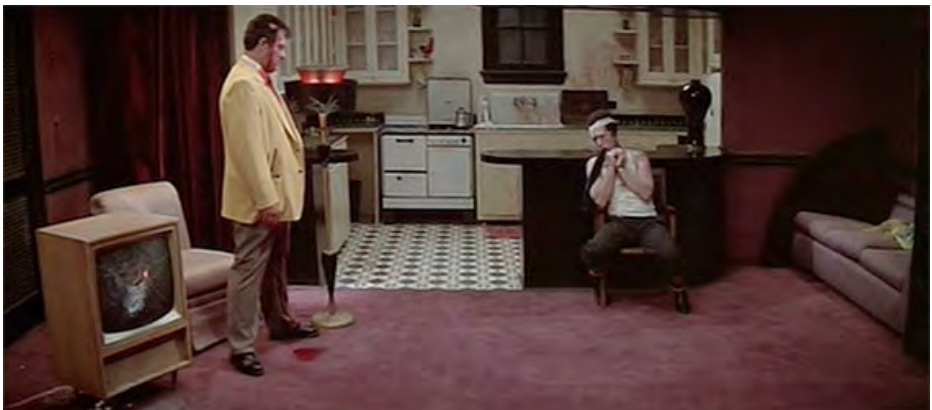
Figure 1 – From David Lynch's BLUE VELVET, an interstitial time-image cut out of normal continuity.

Movement-images presented in film accord with the viewer's sensorimotor schema that guides the framing of images and consequent bodily reactions. Thus, these images show time passing in subordination to movement. Obversely, what Deleuze terms the time-image depicts the work of time as such by breaking with or stunting the sensorimotor schema by way of irrational cuts, false continuity, absent movement, or the co-presence of variable pasts. In order to represent time in a "direct," pure state to which "aberrant movements" relate, the image "[frees] itself from sensory-motor links" (Deleuze, Cinema 2 41, 23). In a scene from David Lynch's Blue Velvet (1986), the yellow man, having been shot in the head, nevertheless remains standing (see Figure 1). Besides his barely noticeable swaying, the scene is a still shot of time unhinged from movement and into which the protagonist stumbles. As an interstice, the time-image provides a simultaneous before and after separate from the adjacent cinematic images, unique to and contained within only that interstice: a center adrift in its own indeterminate time (39).