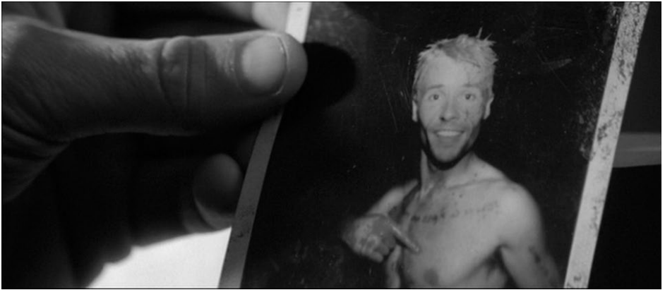
Figure 2 – Christopher Nolan, MEMENTO . This shot from a black-and-white flashback foregrounds the imbrication of recording apparatuses (film, photography, tattoo, and neurological) and their control over time's disjoining and concomitant bodily-technical articulation.

image framed by cinema's technics of selection, and for it to be taken up by the spectator would introduce a distinct regime of relinkages subject first to the interstice but also to the brain's own technics of calculation and retention grounded in the material substrate of its memory. Memento's interstices convey in one way how the time-image relies on the spectator to instantiate its temporal embodiment. As the film's reverse chronology unfolds, the spectator reticulates within memory a continuity conforming to normative sensorimotor schemata. However, our question lies not in how the time-image operates as an aesthetic, but in the image that results when we try to make sense of the time-image while simultaneously experiencing the passing actuality of time as we do so. This is the error-image: a movement of thought whose anticipatory protention lacks any subsequent retention and therefore cycles forward unresolved, left to the throes of memory's unconscious expanse.