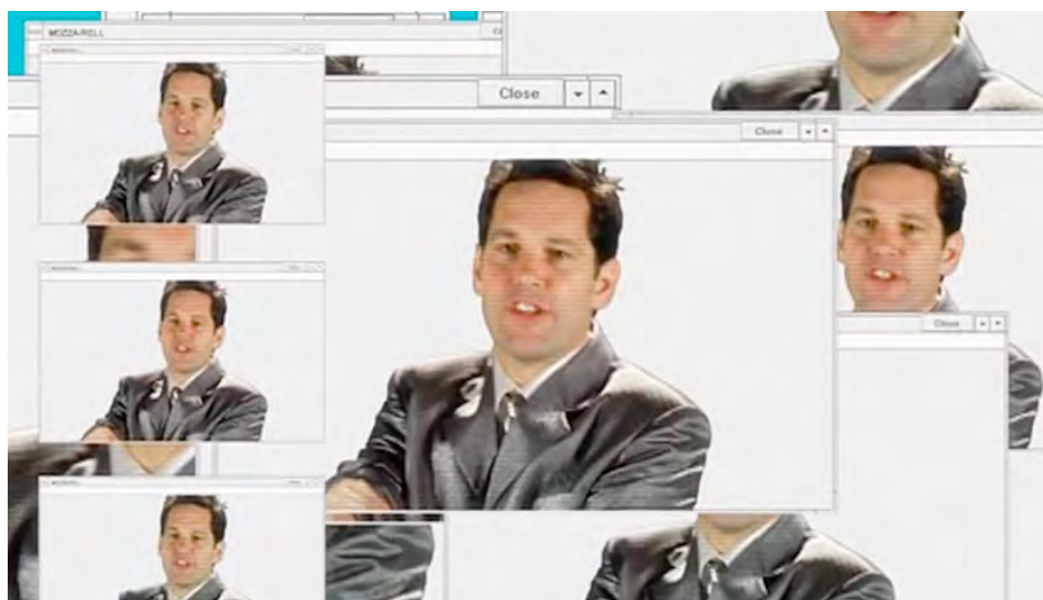
Figure 3: Two frames from the final programmatic breakdown in “Celery Man.”