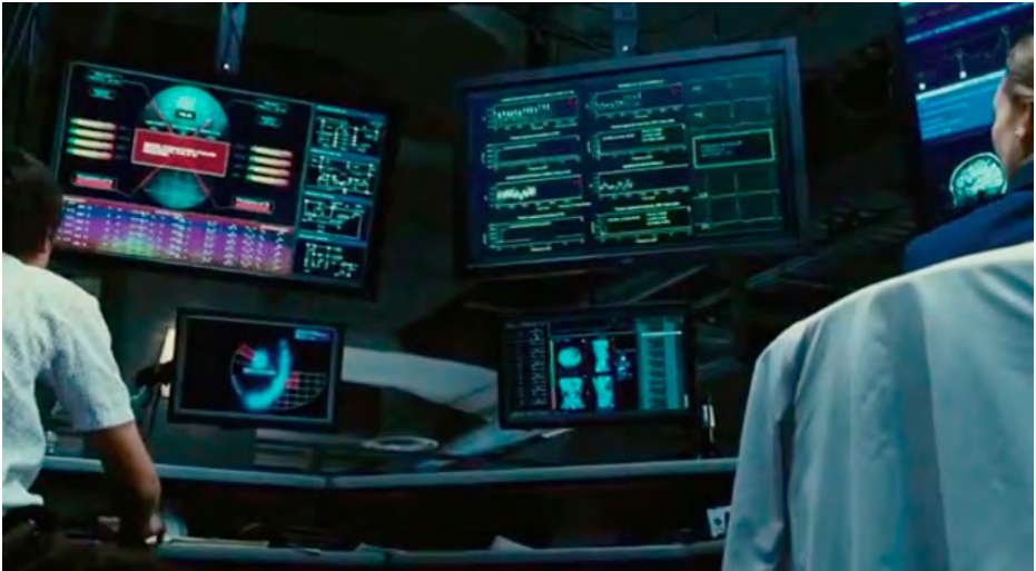
Figure 7 – The audience bears witness to the technical complex of post-production and monitoring that drives the concurrence of Colter Stevens's programmatic “Source Code” experiences with the SOURCE CODE film itself.

collapses the diegetic/non-diegetic split, a distinction often undercut by post-cinema's reflexive incorporation of the technical conditions of its own production. When we see Stevens's self-representation in a spherical room-cum-helicopter-cockpit, this is clearly a diegetic representation for the audience as well. But when we look on the wall of hardware and monitoring devices that afford the military team access to Stevens's computationally supported brain states, the diegesis collides with its own non-diegetic foundation in post-production special effects (see Figure 7, below). Here, the erring movement of thought takes on more than the stitching together of dissociated temporalities. It must come to grips with the gratuitous visuality made possible by the absence of the camera. If cinema's most experientially intense problem for consciousness is pure time or duration, then post-cinema's might very well be the other, non-temporal end of Bergson's heuristic concepts from Matter and Memory : pure perception.