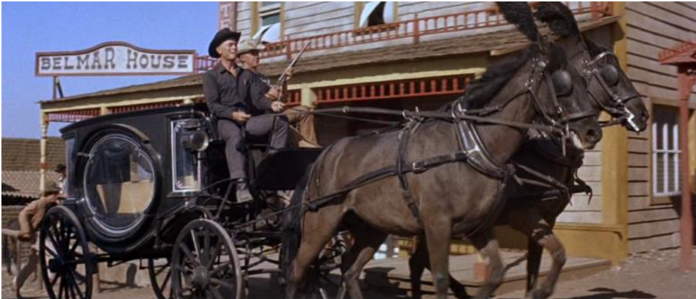
Figure 9. Chris (Yul Brynner) giving a migrant a proper burial: THE MAGNIFICENT SEVEN (USA 1960)

One intertextual film historical reference that depicts a cowboy's attempts to give a "migrant" a proper burial and ends up with a Mexican village being "saved" is John Sturge's THE MAGNIFICENT SEVEN (USA 1960). This Western introduces its protagonist Chris (Yul Brynner) when he brings a dead "migrant" to the village cemetery in a small town in the southern United States and then wields his gun in order that the stranger may receive a suitable burial despite the resistance of the white residents. He is then hired by Mexican farmers to protect their village from bandits and brought to Mexico.