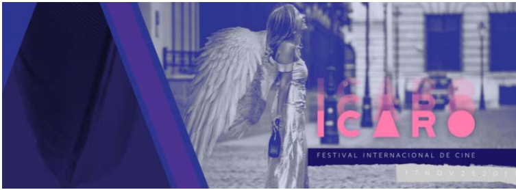
Fig. 1: Ícaro International Film Festival 2017.